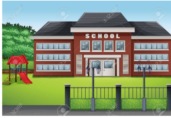
The Yellow Elementary school

Take a look at the enclosed description of the Elementary school Yellow. Please select factors (aspects) from the description, which support inclusive education and which might hinder it.