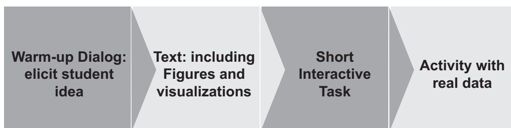
Figure 1: Flow chart of the pedagogical design for each section. Chapters typically contain several sections, each of which explores a single topic related to the subject of the chapter.

to think about each dialogue and choose one of the fictional speakers with whom they most agree and explain why. A sample dialogue is given below: