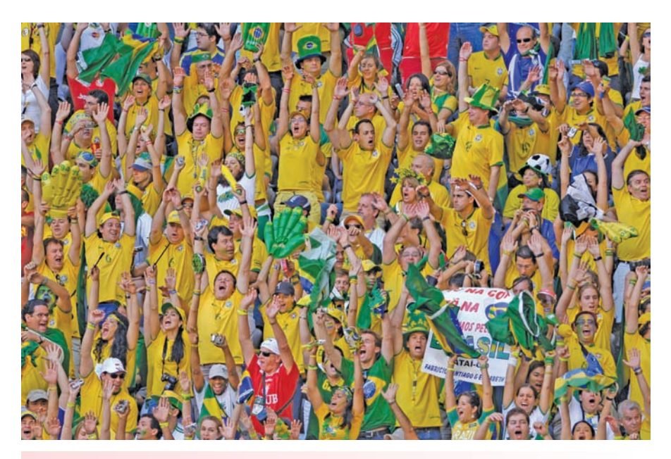
Though we know we are all unique, personality suggests we share common characteristics.