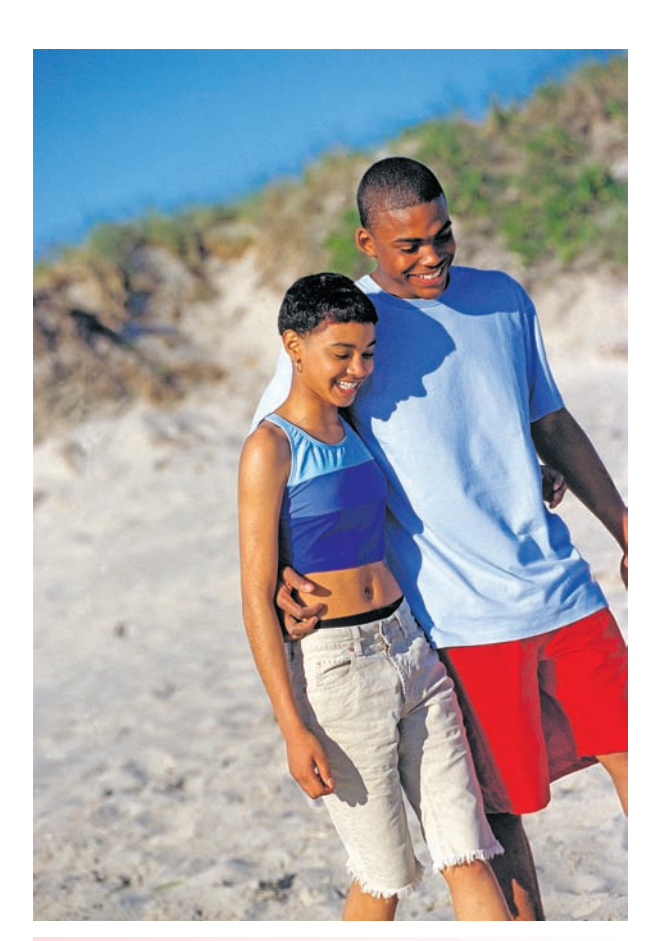
Is it important to understand the basic nature of human beings?

of good, accurate measures of individual differences. In these instances of 'individual differences', it is frequently really an abbreviated form of 'individual differences in personality' or variables related to personality. You will already be getting the idea that there are a variety of approaches to studying and researching personality; we will now look at some of them.