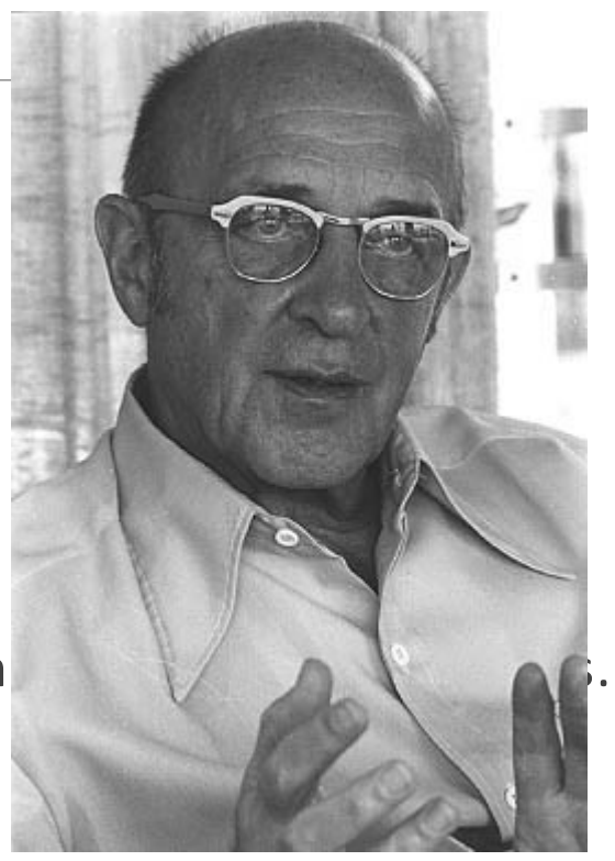
Carl Ransom Rogers