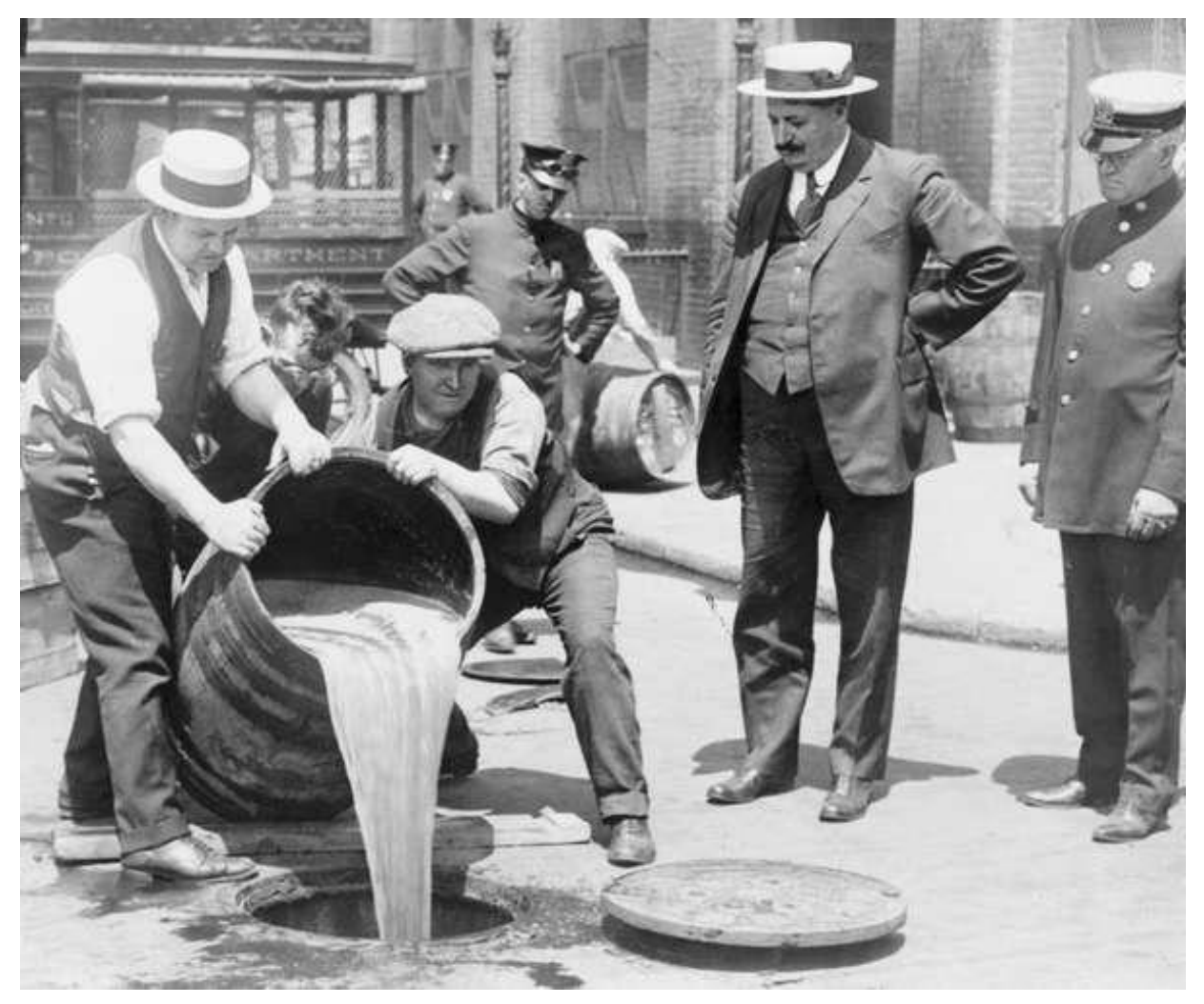
Seized booze is poured in the gutter – what a waste!

Home neighborhods: Hell's Kitchen North, Hell's Kitchen South, Five Points, Lower East Side