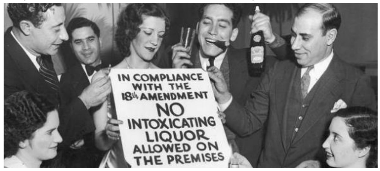
Customers of one of the speakeasies mock the prohibition law.

The 18<sup>th</sup> amendment prohibited the manufacture, transportation and sale of alcoholic beverages. It looks like a scourge to humanity; the opposite was the truth for us. The mobsters found ways to deliver the booze to people who wanted it, despite the laws. This is where famous bootleggers (smugglers) were born, and speakeasies (illegal bars) flourished. Untaxed money was there for taking, and we have taken our share so far. But it seems that we might be entitled to more after all.