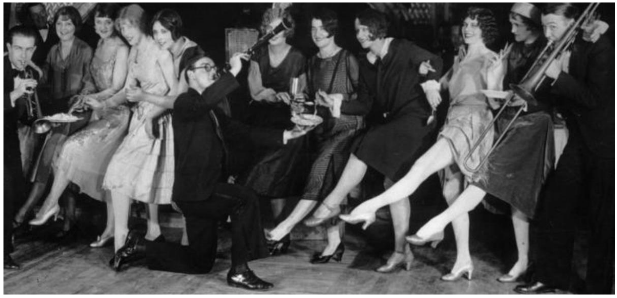
New music, new fashion and lust for life. All that was brought by jazz.

The Great War finished in 1918 and people were shaken by its horrors. The war was over, and Americans did not want to go back to the trenches of the Western Front in their thoughts. They wanted to feel alive. They wanted to enjoy all the beauties of life. They wanted to love, drink, laugh and dance. This is where jazz craze struck home.