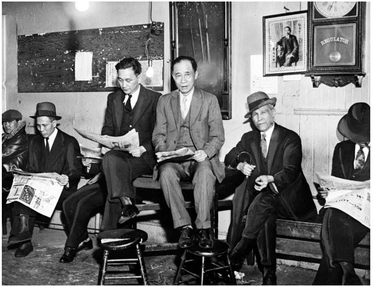
Members of the Hip Sing Tong – one of the Chinese criminal syndicates

Home neighborhods: China Town, Two Bridges, Upper East Side