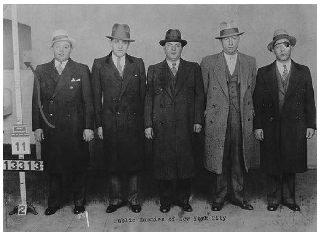
Mobsters "Public Enemies of New York City"