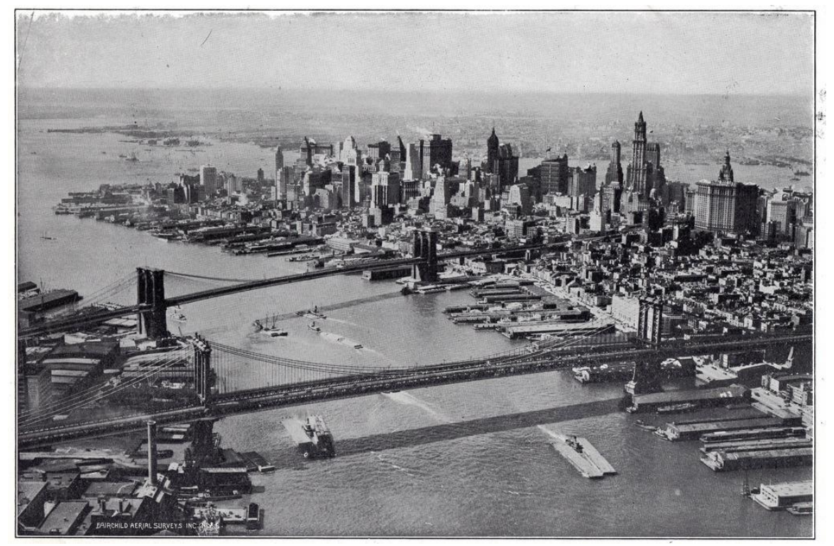
View of Lower Manhattan in 1928.