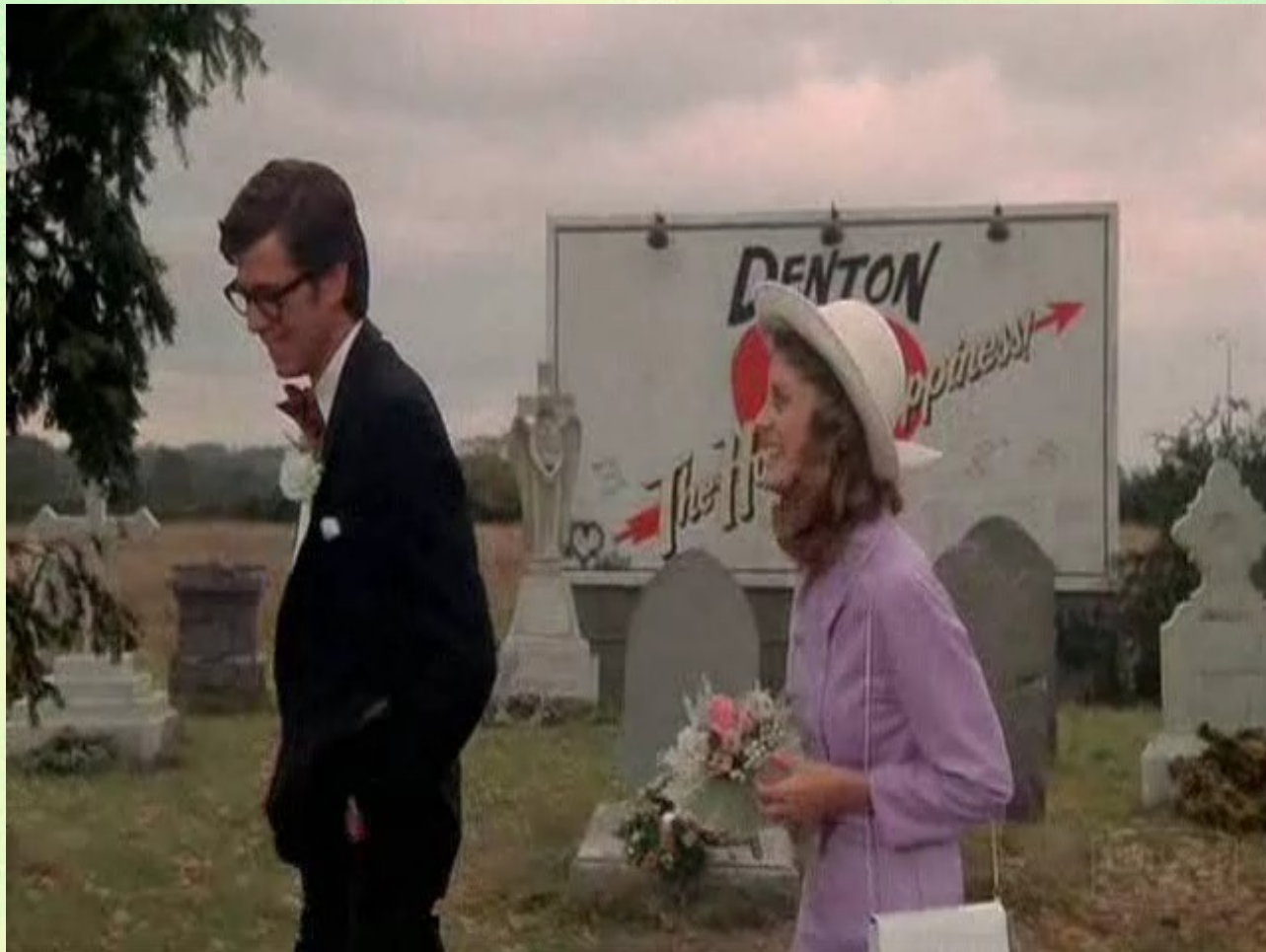
The Rocky Horror Picture Show (1975)

http://www.albinoblacksheep.com/flash/has