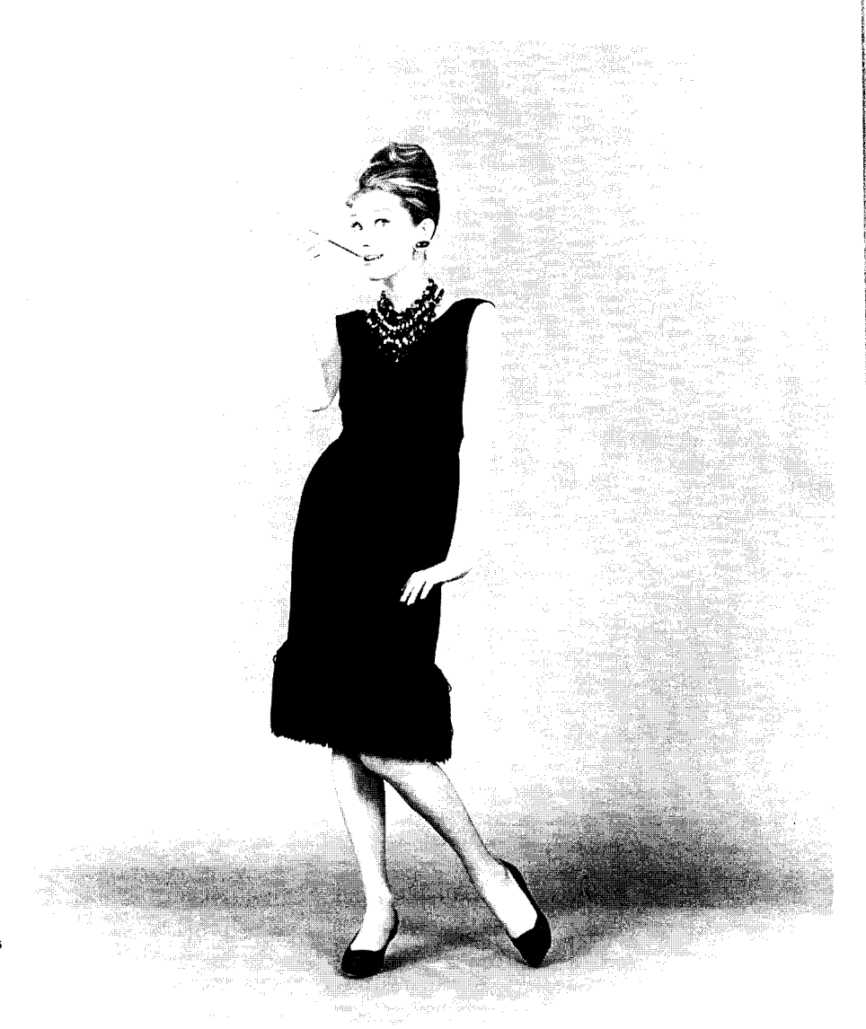
Copies of this fringed dress designed by Givenchy for Audrey Hepburn ( Breakfast at Tiffany's , 1961) soon appeared in the high street

its own motifs . . . which unfold in a temporality which does not correspond with key developments' (1990: 205).