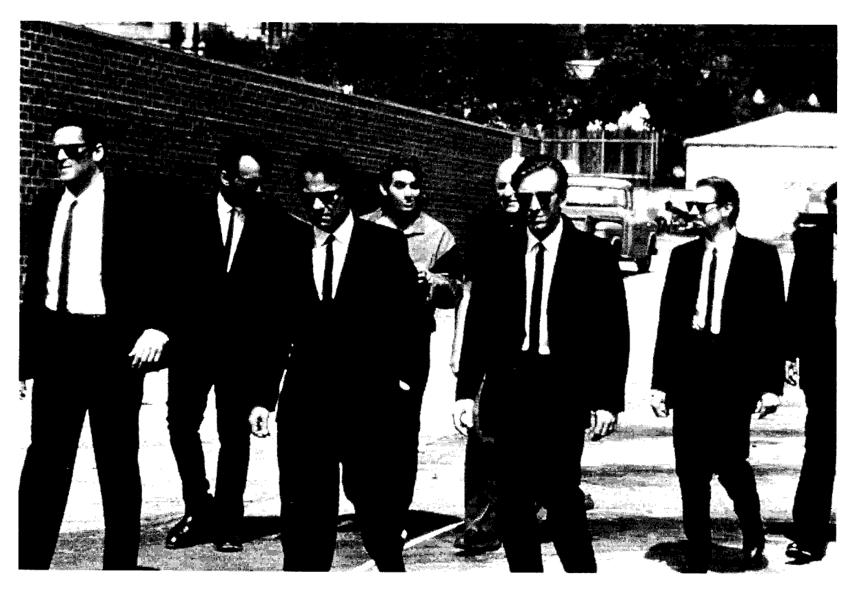
Updated gangster chic—Reservoir Dogs (1993)

complement, or, in some cases, subvert the meanings suggested by plot, dialogue, and character. Costume, in this respect, is read as a signifying element which carries meanings or creates emotional effects, particularly in relation to character. However, although traditional mise-en-scène analysis encourages attention to costume, it is not interested in dress or costume per se. Costume is seen as the vehicle for meanings about narrative or character and thus simply as one of a number of signifying elements within a film. Thus, David Bordwell and Kristin Thompson link the analysis of costume to that of props and argue that 'In cinema any portion of a costume may become a prop; a pince-nez (Battleship Potemkin), a pair of shoes (Strangers on a Train, The Wizard of Oz), a cross pendant (Ivan the Terrible), a jacket (Le Million)' (1980: 81). Similarly, in his article 'Costuming and the Color System of Leave her to Heaven', Marshall Deutelbaum provides an intricate analysis of the way in which 'the film constructs a system of relational meaning through consistent oppositions encoded in the colors of the