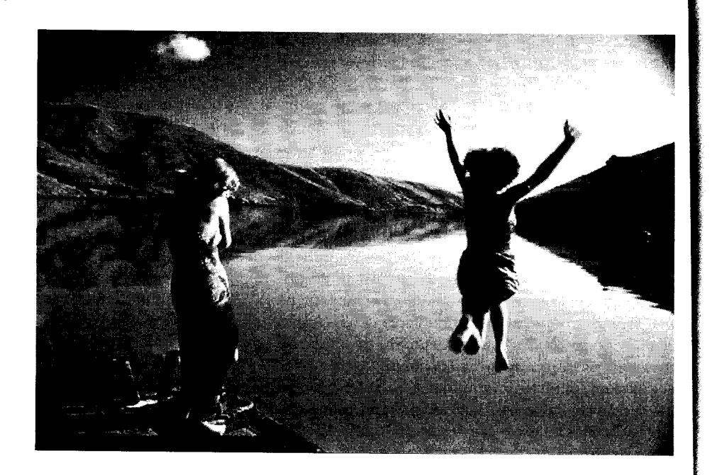
'Focused deployment of music for irony and excess'—Heavenly Creatures (1994)

of composed scores. Others, primarily critics grounded in film and cultural studies, and also those in the growing field of popular music studies, are enthusiastically investigating the range of possibilities inherent in this new paradigm.