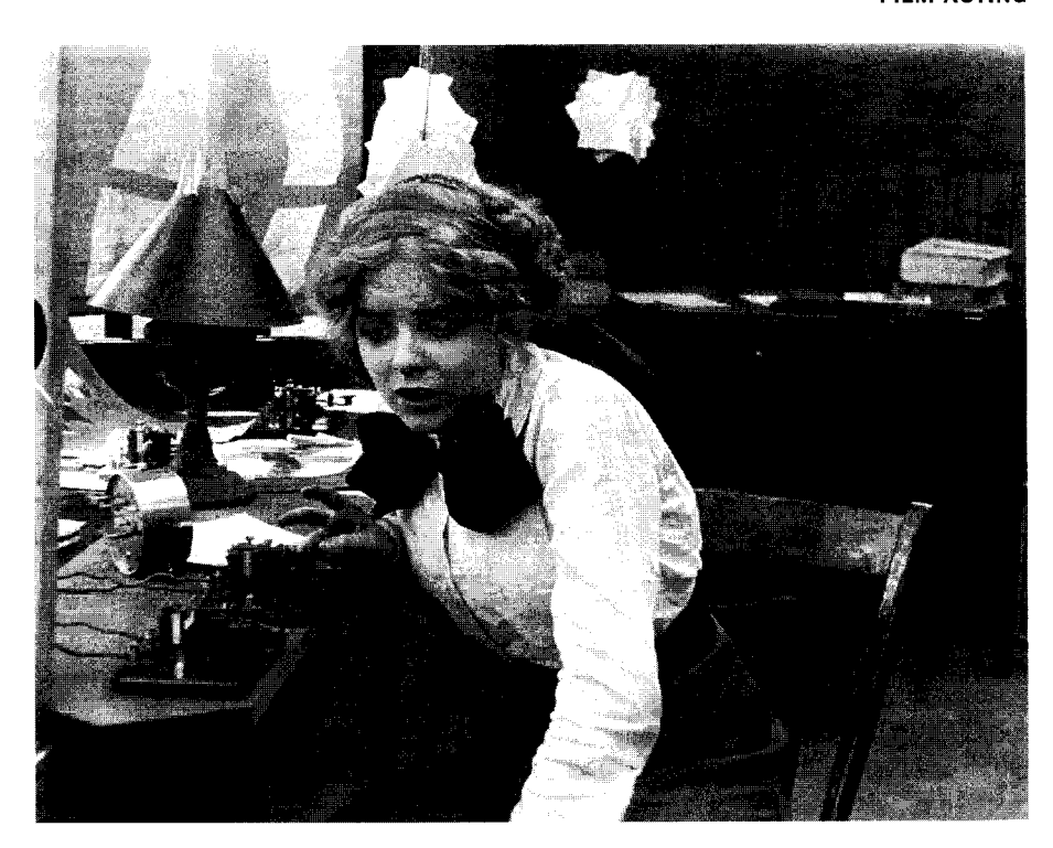
Towards verisimilitude— Blanche Sweet in an early Griffith film for Biograph/ The Lonedale Operator (1911)

shifts from the sign to questions of style. In her analysis of film acting in the early Biograph films of D. W. Griffith, Pearson traces a transformation between 1907 and 1912 from what she calls the 'histrionic code' to the 'verisimilar code'. In the former, the actor represented emotions through large gestures, and Pearson refers to this style as 'histrionic' because of the way in which it used conventions which did not imitate a sense of the everyday but belonged to the stage or screen drama only. In contrast, the verisimilar code was judged to be more 'realistic' because it was not so clearly conventionalized and gave more of a sense of everyday behaviour.