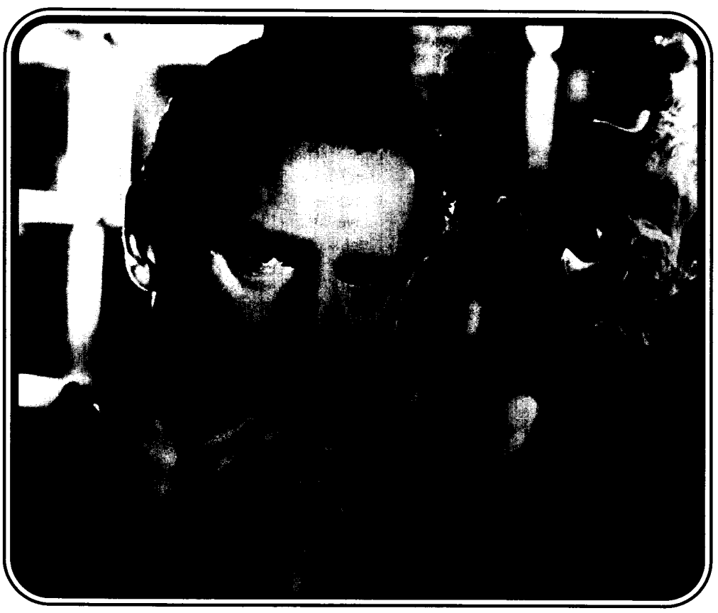
The promotion of Schindler's List included the distribution of material for high school class discussion.

and less than 6 million spectators for the last two).<sup>37</sup> Yet to build their appeal with a foreign audience, films relying on less standardized formulas need innovative marketing campaigns that