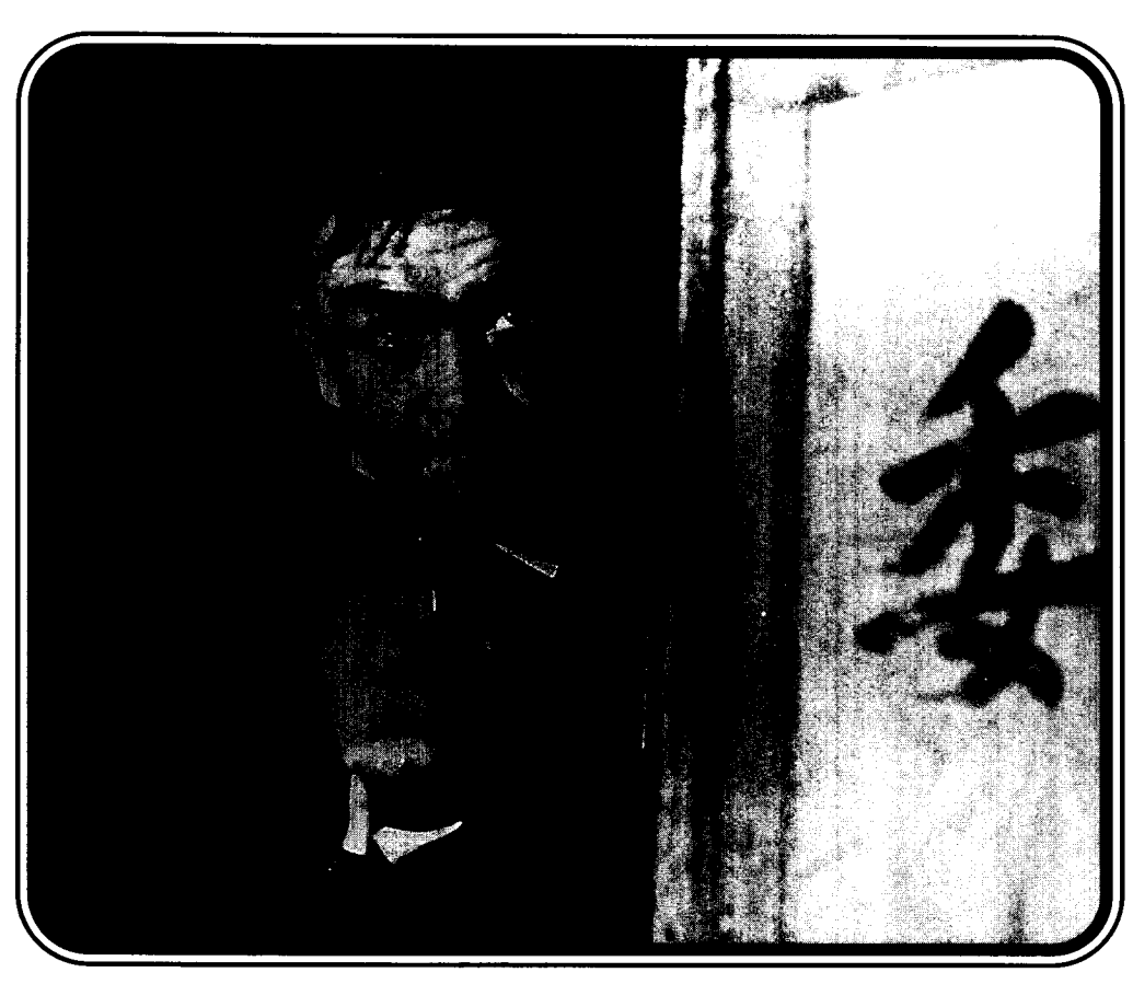
Popular stars such as Sean Connery, known for his James Bond, are often cast in U.S. films because of their popularity in Europe.

In some cases, however, studios deliberately choose to postpone the foreign release of films and adopt a more cautious strategy. In particular, they tend to do so with films that they