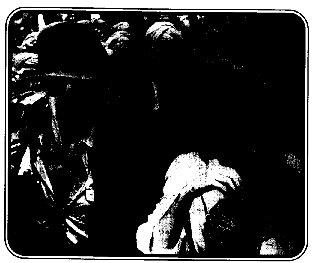
The appeal of U.S. blockbusters has dramatically increased in France since the late 1980s.

he marketing of high-budget films in our current "image society" or mass media age has emerged as a complex operation designed to predict the public's reactions and, above all, to influence the reception of block-busters in such a way as to widen their appeal with the largest possible cross section of the population worldwide. As the major U.S. film companies (the Majors) have become integral parts of