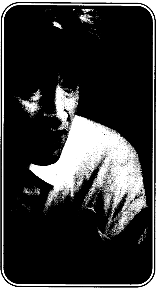
In France, film directors are perceived as auteurs (pictured here is David Lynch).

spreads play a much greater role than film reviews. However, even more important is the publicity generated by television programs featuring movies, film festivals, and star appearances. France's "proud cinematic tradition" has created an important "film culture" as well as independent-minded spectators who like to think of themselves as informed film critics. <sup>11</sup> Film clips from new releases are often shown as newsworthy events during mainstream daily reporting; twice a