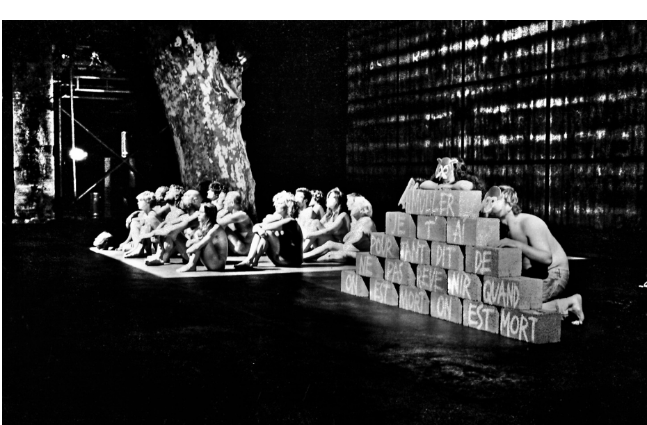
Anathème, 2005.