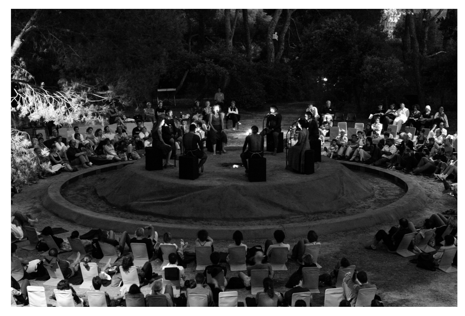
Mue, 2005.