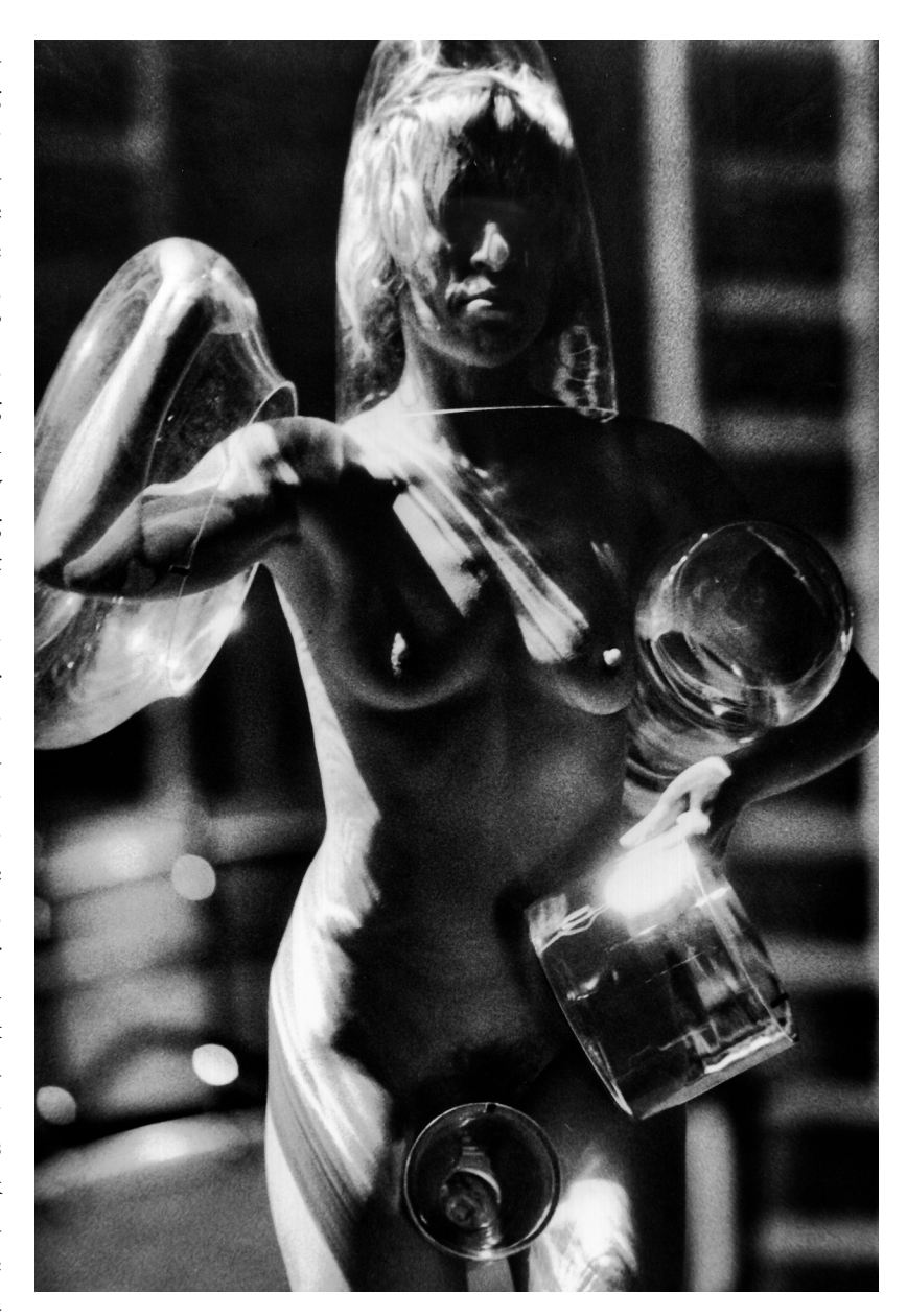
L'histoire des larmes, 2005.

composition incorporates the vast expanses of the Cour d'Honneur and the facade, the trajectory of the groups and objects, and the temporal unfolding of the musical score (renaissance harp, percussion, and voice). With an admirable architectural and pictorial sense, Fabre gives us one scene after another each in a different style, from an individual routine to a ballet for six or eight dancers, to simultaneous and coordinated actions. As in a Hieronymus Bosch painting (think of his Last Judgment at the Alte Pinacothek in Munich), elements are juxtaposed with a certain autonomy, but the viewer is in a position to perceive a