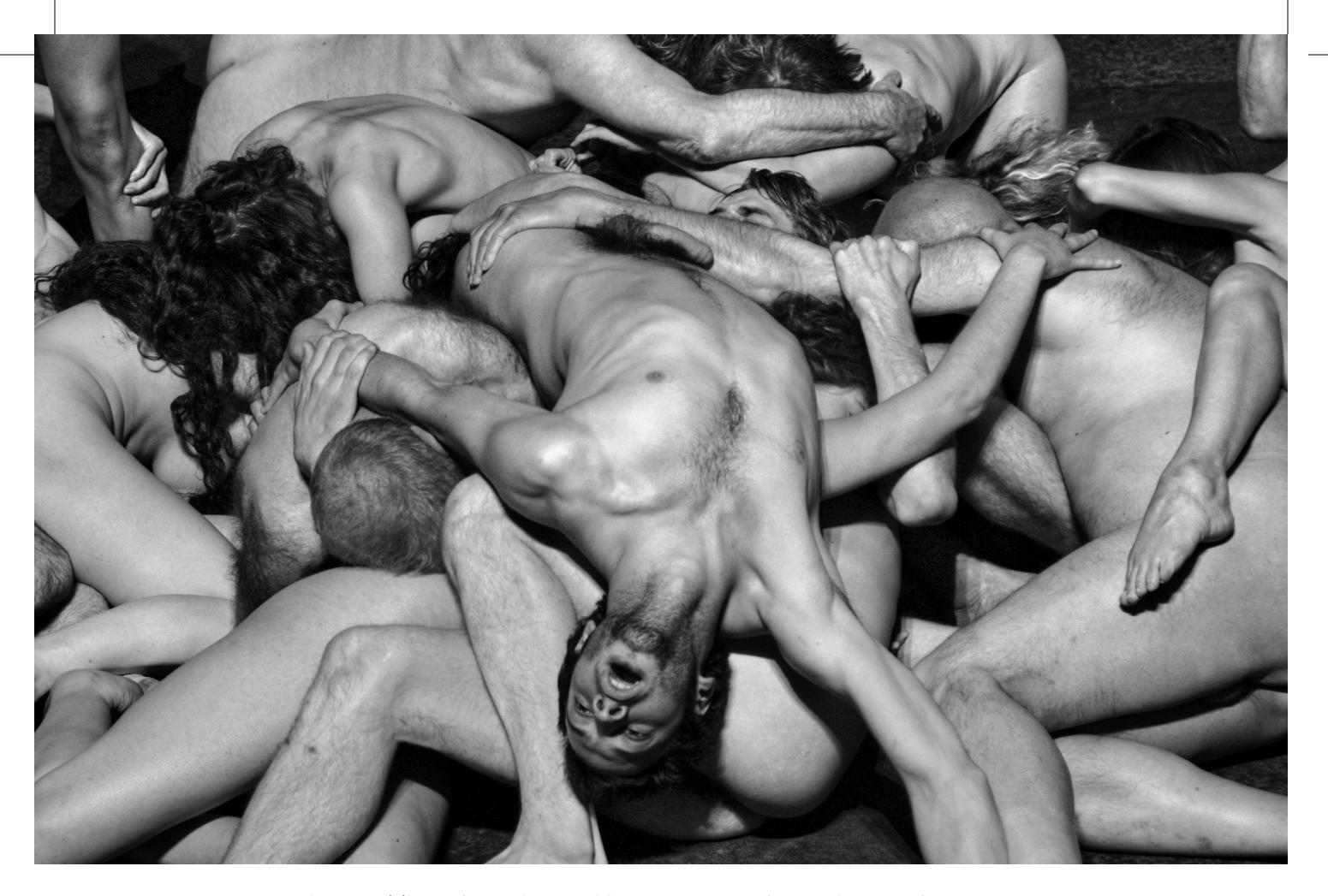
Anathème, 2005.

the men. The audience has trouble concentrating during this unending oratorio; many leave the theater, having run out of energy and reached the end of their tethers.