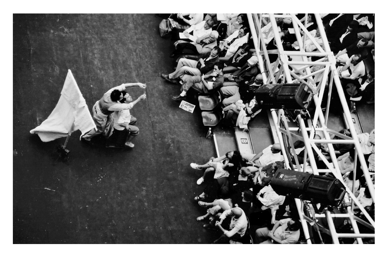
of Life of Galileo, 2005.

time immemorial, calamity today feeds on the death of ideologies, on the absence of any political analysis that might lead directly to action, on the renunciation of critical thinking. Calamitous thinking—of the end of history, of postmodern relativism, of the well-fed and right-thinking—displaces the natural plague onto social life, placing us in the axis of evil, threatening us with divine punishment just at the moment when faith has been lost.