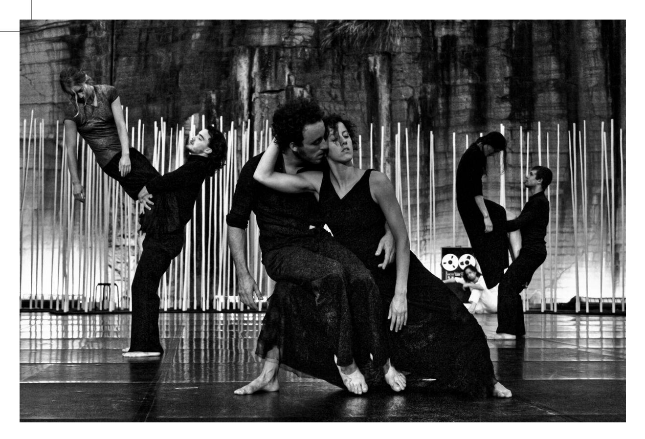
Puur, 2005.

In Puur this state, this "structure of feeling," evolves throughout, stretching from birth to death. The film has the task of locating the story, alluding to events that will then be enacted, performed, in the playing area. It shows the birth of a child and the painful paradox this brings his mother: "Now that I have you I can only lose you." Birth is a severing: "He had to be freed, millimeter by millimeter, from my flesh, made from my flesh. . . . He had to be hacked free, chipped millimeter by millimeter, sundered from me." This image of block-by-block separation is appropriate in a place of digging, the quarry where the live audience has gathered and onto which the film is projected; here the dancer must now cut a few blocks of dance, finding in a duet the heart-tearing creation of the other. Here, at the end of the show, we hear the sound of a rock fall, as if the artistic creation has definitively detached itself from inert matter and each spectator will be leaving with a piece.