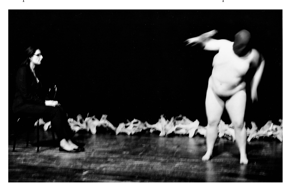
The Biography Remix, 2005.

This remixed biography, which is a sort of work in progress for Abramovic as it recaps her already-long career, is probably a key to understanding the other productions, to evaluate without prejudice the changing relationship between mise-en-scène and performance art. This remix too offers an occasion to contemplate the notion of