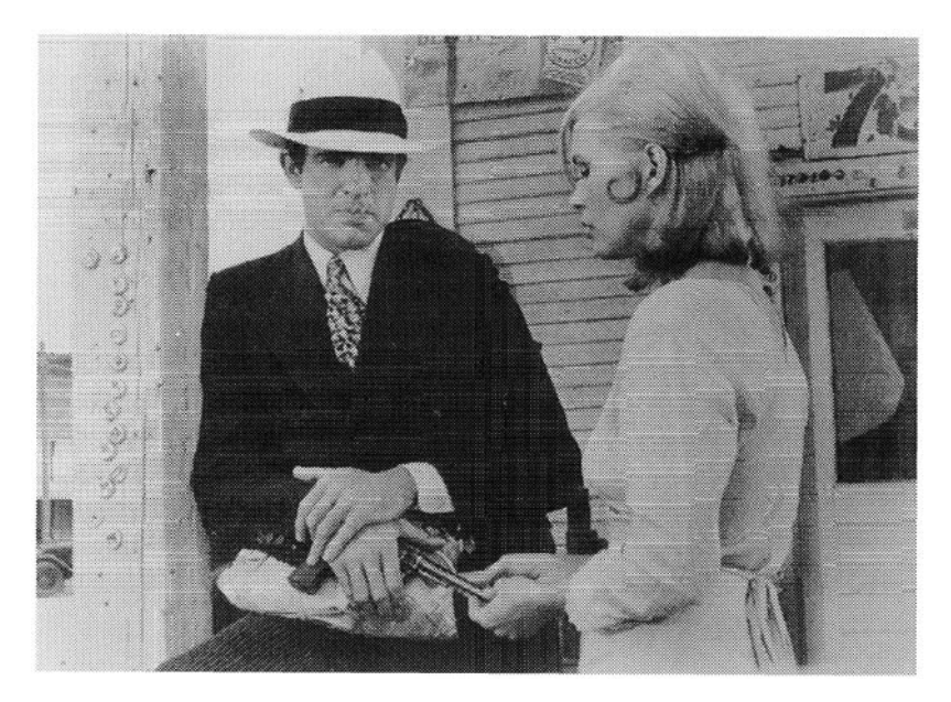
FIGURE 6.2 From the outset of Bonnie and Clyde , capacity for criminal violence is shown alternately as a substitute for or a stimulant to sexual relations.

calls the violent death of an elderly, bespectacled woman in the Odessa Steps sequence of Eisenstein's Battleship Potemkin .