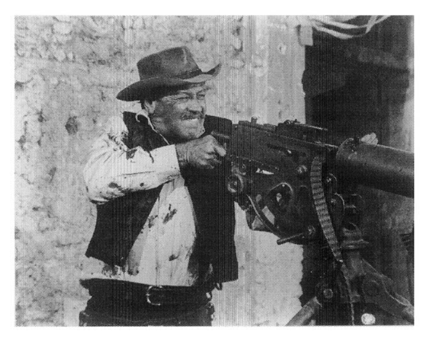
FIGURE 6.3 William Holden in The Wild Bunch. Imbuing a western with a carnage of a war movie was understood, in 1969, as a form of naturalism.

gang. But the violence was meaningful in a context of larger drama. We could hardly enjoy it." Even if one accepted Peckinpah's antiviolence intent in The Wild Bunch , "he sure as hell wasn't getting any such message across to the more vocal members of this audience—or to me."