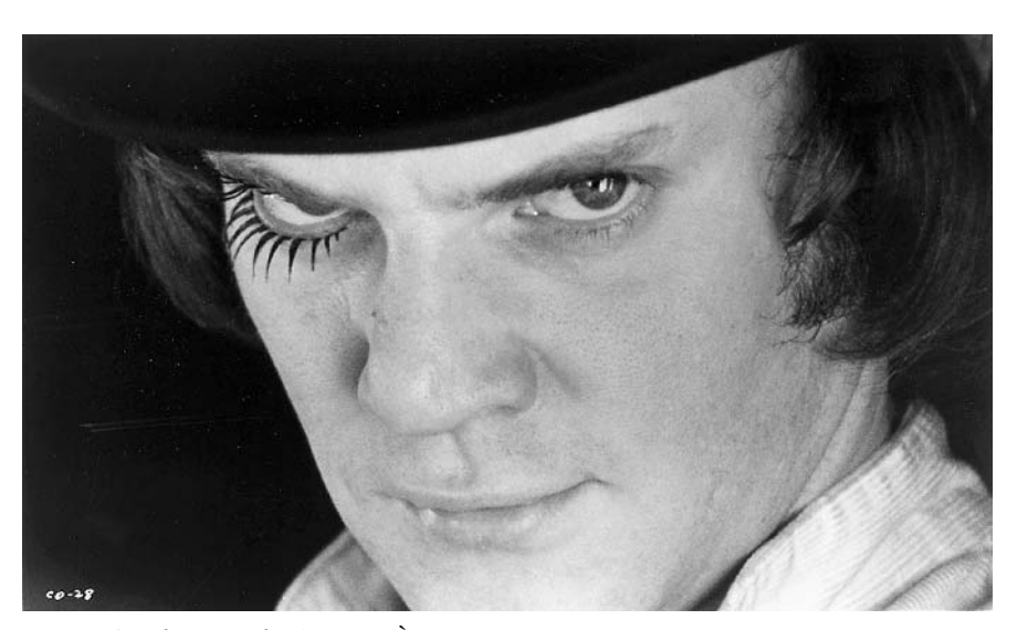
8. The sexual mise-en-scène.

on the cover of Films and Filming for the issue that reviewed the film <sup>42</sup> [Fig. 9]. That Films and Filming took such delight in the film seems to confirm Walker's claim of a "homosexual motif" running through the film since Films and Filming had a covert (or not so covert!) address to gay men. Its review and selection of accompanying photos provides