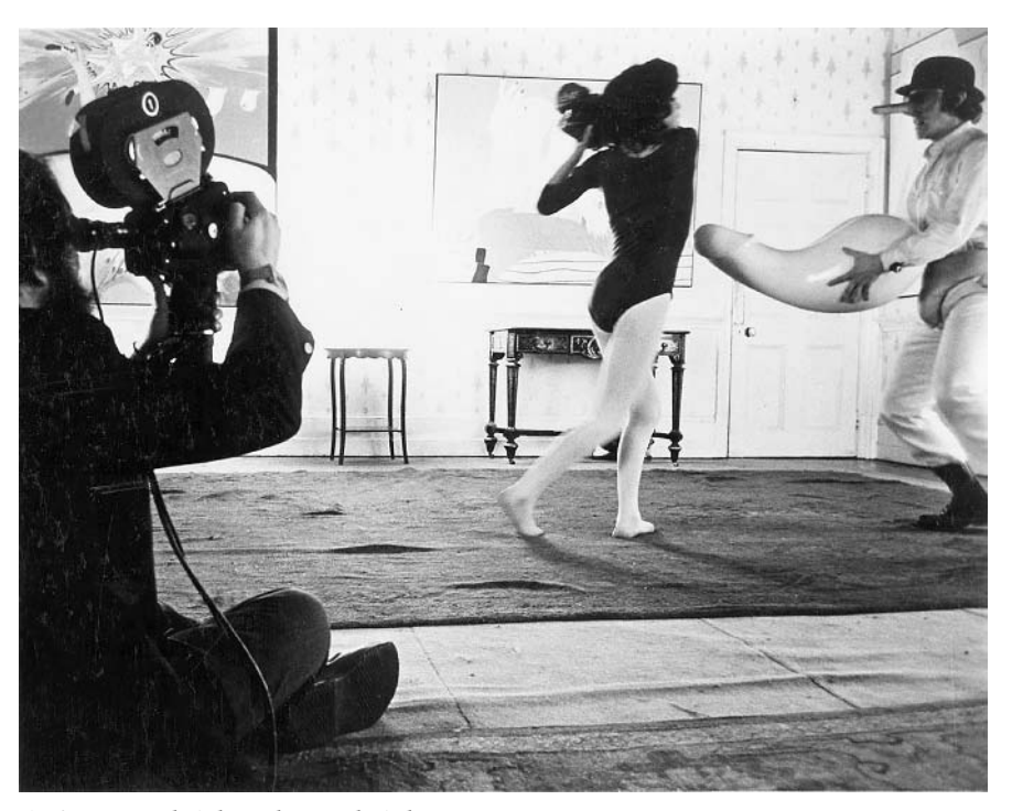
6. Auteur Kubrick and sexual violence.

Those criticizing the film for its representations of violence not only tried to define it as not-art but also argued that the representations had harmful effects and passed the Hicklin Test. Kael probably is relying on contemporary social science theses that proposed that individual experiences with violent images were not specifically harmful but repeated exposure to such images would eventually be bad