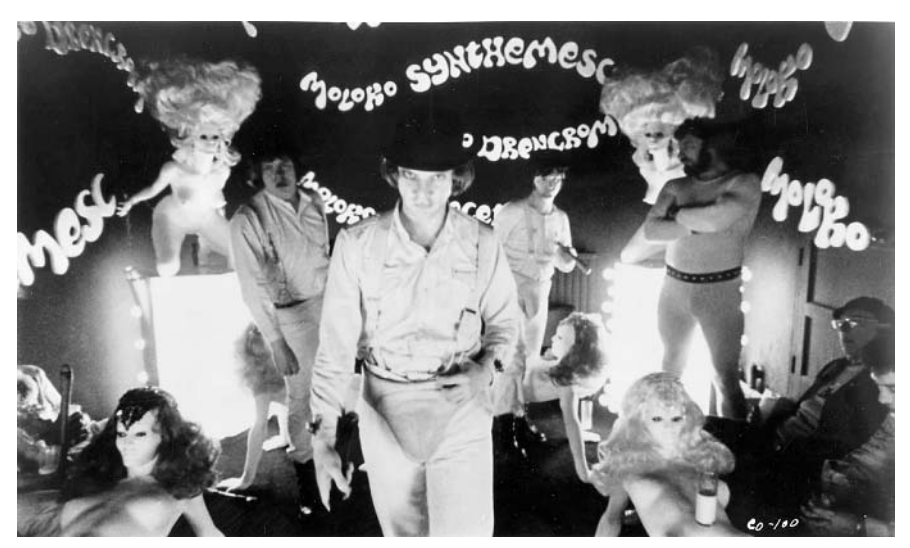
7. The sexual mise-en-scène.

on the cover of Films and Filming for the issue that reviewed the film <sup>42</sup> [Fig. 9]. That Films and Filming took such delight in the film seems to confirm Walker's claim of a "homosexual motif" running through the film since Films and Filming had a covert (or not so covert!) address to gay men. Its review and selection of accompanying photos provides