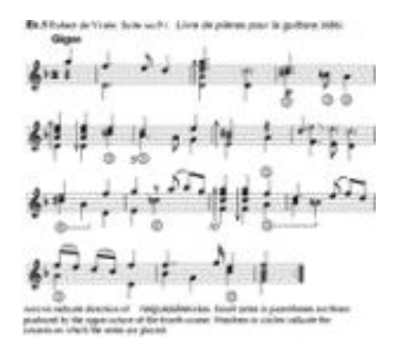
Ex.1 Robert de Visée: Suite no.9 (Livre de pièces pour la guittare, 1686)

From the 17th century, tuning information frequently indicated no bourdons at all. This produced a totally re-entrant tuning: a/a-d'/d'-g/g-b/b-e' with the lowest pitch that of the third course (see, for example, Luis de Briçeño: Método ... para aprender a tañer la guitara a lo español (Paris, 1626/ R ); Marin Mersenne: Harmonie universelle , ii (Paris, 1636–7/ R ); Francesco Valdambrini: Libro primo d'intavolatura di chitarra (Rome, 1646), Libro secondo (Rome, 1647); Antoine Carré: Livre de guitarre (Paris, 1671/ R ); Gaspar Sanz: Instruccíon de música sobre la guitarra española (Zaragoza, 3/1674)). Two Italian sources for this re-entrant tuning offer another variant: a/a-d'/d-g/g'-b/b-e' with an upper octave on the third course ( I-M Oe Campori 612.X.L.10.21 and I-Bc AA360). The most common modification to the re-entrant type tuning was a/a-d'/d'-g/g-b/b-e' which, judging by the musical requirements of their tablatures, was used by the leading composers of guitar solos of the time: Francesco Corbetta, Angelo Michele Bartolotti, Giovanni Battista Granata, Robert de Visée (ex.1), Ludovico Roncalli, and others.