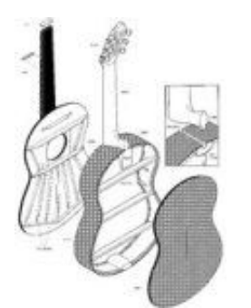
Exploded diagram of a modern guitar showing the Spanish and...

Fig.1 shows the parts of the modern classical guitar. In instruments of the highest quality these have traditionally been made of carefully selected woods: the back and sidewalls of Brazilian rosewood, the neck cedar and the fingerboard ebony; the face or table, acoustically the most important part of the instrument, is of spruce, selected for its resilience, resonance and grain (closeness of grain is considered important, and a good table will have a grain count about 5 or 6 per cm). The table and back are each composed of two symmetrical sections, as is the total circumference of the sidewalls. The table is supported by struts of Sitka spruce, which contribute greatly to the quality of sound. Over-extraction of many of these woods led to a global shortage at the end of the 20th century, and