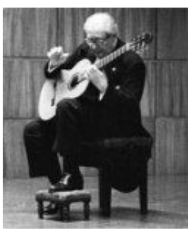
Andrés Segovia, 1963

resulting in a much greater flexibility. To further increase the effective size of the diaphragm, Fischer also experimented with moving the soundhole to the top of the table, and splitting it into two semicircles. The Australian maker Greg Smallman used a somewhat similar system, although he preferred to place his grid at an angle of 45 degrees to the grain of the table.