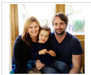
Age gap: She's old enough to be his ... wife