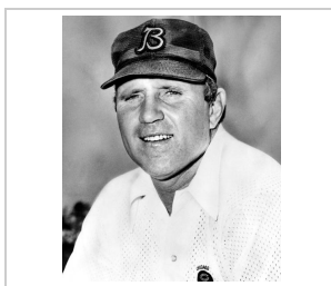
Former Bears coach Jack Pardee dies at 76