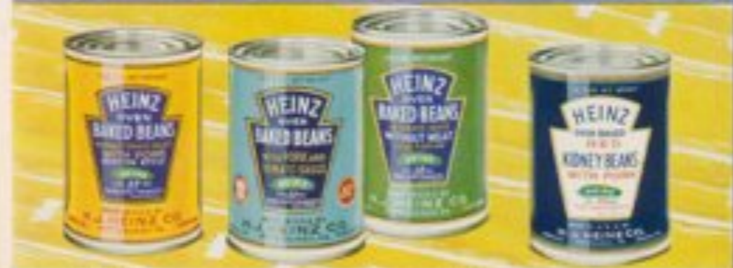
BOSTON STYLE - WITH PORK