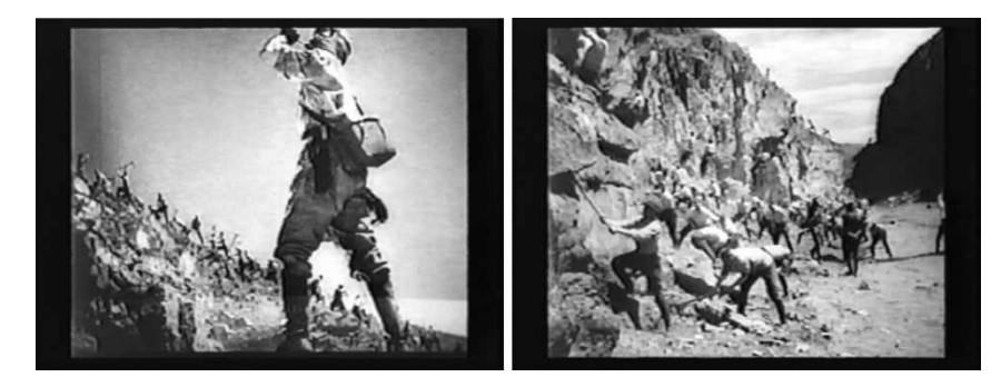
Figure 6. Salt for Svanetia by Mikhail Kalatazov (1929)

Soviet industry suffered. In Buck-Morss' observation, this norm-breaking, fundamentally non-Taylorist, method of organizing work was also linked to the project of the 'race on time':