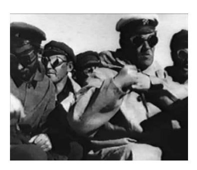
Figure 1. Turksib by Victor Turin (1929)

community in which 'life is asleep.' 'And the tombs of the East stand sentry' over this sleeping lot, who seem to have taken leave from the course of history. The following images are of numerous half-ruined mosques—emblems (or perhaps causes) of the lack of progress. But this community's stagnation is soon to end, as an intertitle reading 'ALARM' so dramatically announces—the stylized and medium-sized letters suddenly expand and take over the screen. Accordingly, the natives and the surrounding nature respond to the wake-up call: On arrival of the 'strangers' and their vehicle, the livestock herds run in panic, the dogs start barking, and the locals, guardedly, start to leave their huts.