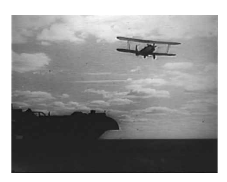
Figure 4. Three Songs for Lenin by Dziga Vertov (1934)

that is underlined constantly by the intertitles and finally epitomized in the film's closing montage sequence. As noted above, the sequence in Turksib that depicts the 'first encounter' between the old and the new starts and ends with images of an airplane's graceful bird-like flight. Machines that allowed humanity to overcome the limitations of its natural body, by facilitating journeying through space, also inspired the imagining of a better world. In The Arcades Project , Benjamin reminded his readers of this utopian promise of the originary images of airplanes: