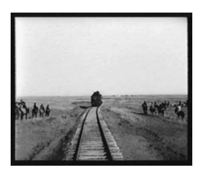
Figure 5. Turksib by Victor Turin (1929)

the length of each shot, shorter and shorter. Clearly, despite their fervour, the nomads, riding on their horses, oxen, and camels, are no match for modern technology and eventually fall behind. For the people of Turkestan, their future emancipation in history has to come by embracing modern technology. The race ends with the image of a camel 'bowing' at the rail tracks as the locomotive pushes forward.