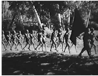
Figure 2. Three Songs for Lenin by Dziga Vertov (1934)

and Iran were promoting and enforcing similar ideas and policies. Other than devotion to a linear conception of history, the underpinning assumption, among others, that the nationalist modernizers of Turkey and Iran and the Soviets shared was the Orientalist divide between East/West and primitive/civilized. It was in this discursive terrain—its genealogy dating back to the nineteenth century—that Muslim women's clothing, particularly the veil, appeared as the most visible and outward indicator of the Orient's allegiance to the past.<sup>22</sup>