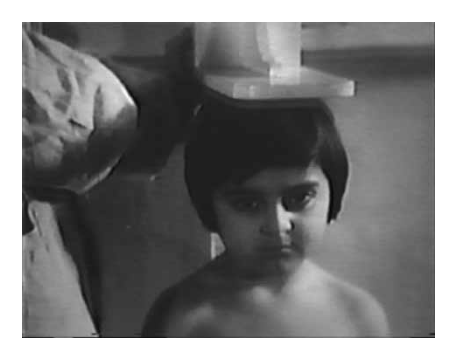
Figure 3. Three Songs for Lenin by Dziga Vertov (1934)