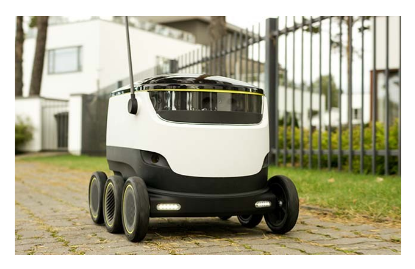
Starship – local delivery robot