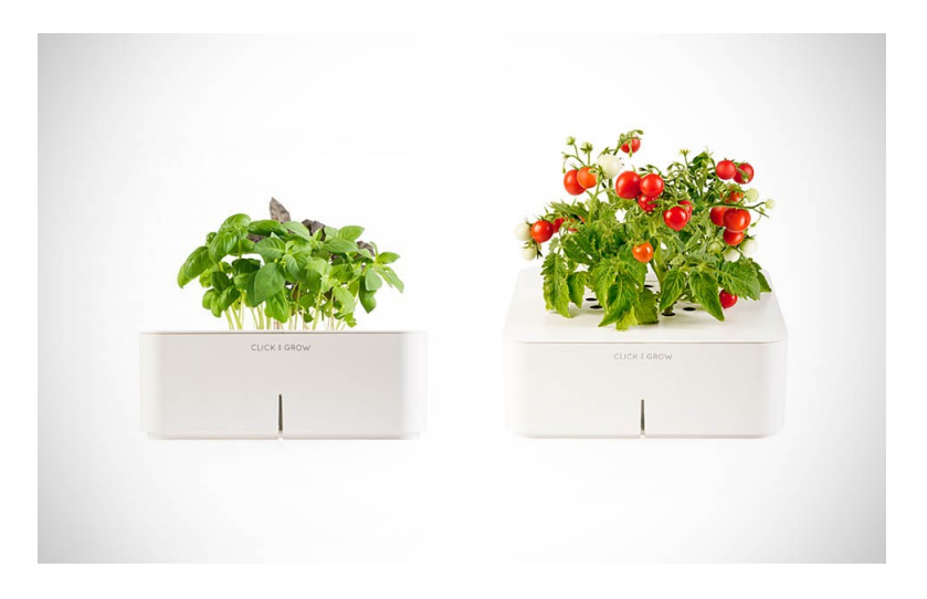
Click & Grow