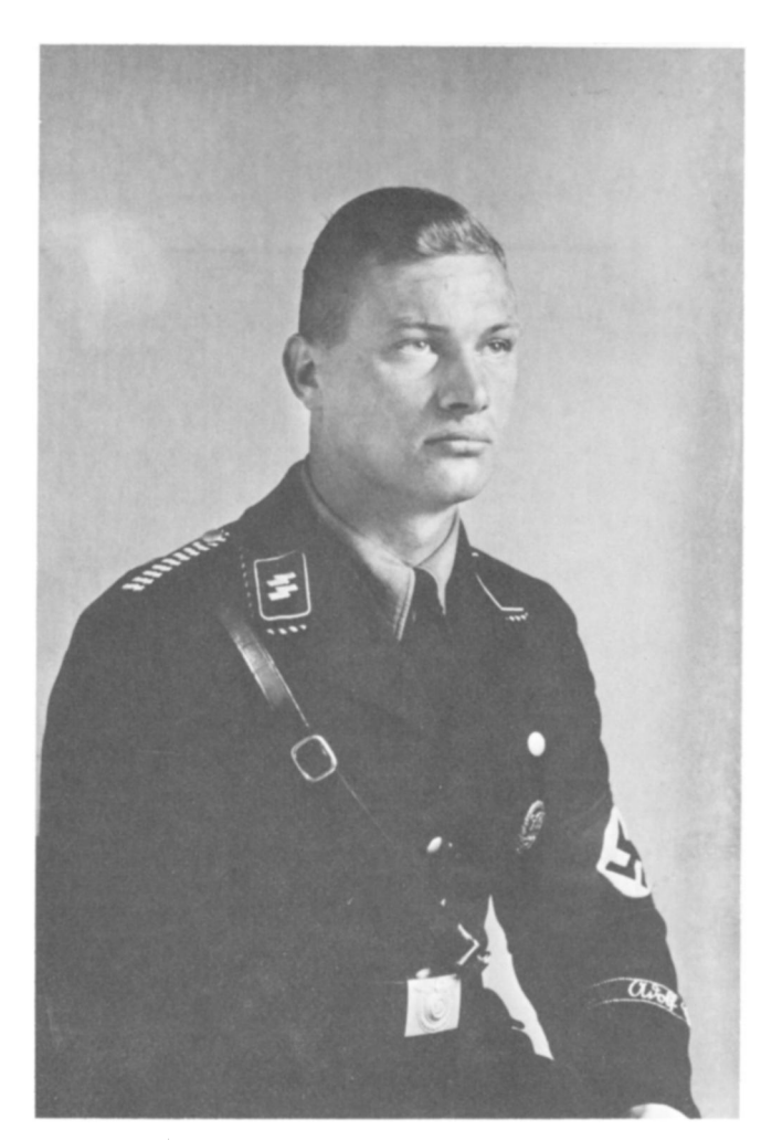
August Sander, SS-Mann, Köln 1938, photograph.

In Arbus' photographs, narrative and visual facts splinter into a strange and twisted moral tale. The Topless dancer in her dressing room (1968), sequined and centered in the picture plane, is balanced by the dressing table on either side, a mirror, and the three lights behind her. The shabby background of empty glasses, scrambled clothes, and a decaying wall, documents the picture's point about a transient, plastic life. The dancer is equated to her background. The picture almost works, but the composition's well-planned artifice divides the visual and narrative facts. The eye reads the background as an indictment against the subject, while the subject's alignment makes the background hard to see, almost visually extraneous. There are countless other examples of Arbus' symmetry: a curtain, reinforcing stage center, parts to reveal a naked man being a woman; the woman with pearl earrings is further centralized and mimicked by her rounded jewelry, and the twins echo each other.