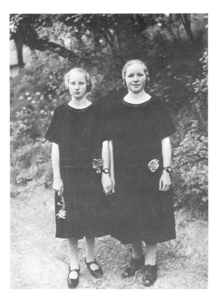
August Sander, Bauernmädchen, Westerwald 1927, photograph. Sonnabend Gallerv.

Everybody has this thing where they need to look one way but they come out looking another way and that's what people observe. You