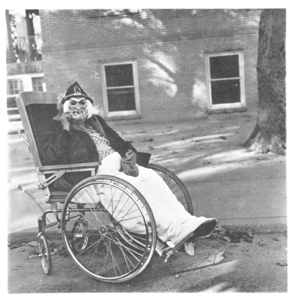
Diane Arbus, Masked Woman in a Wheelchair. Pa. 1970, photograph.