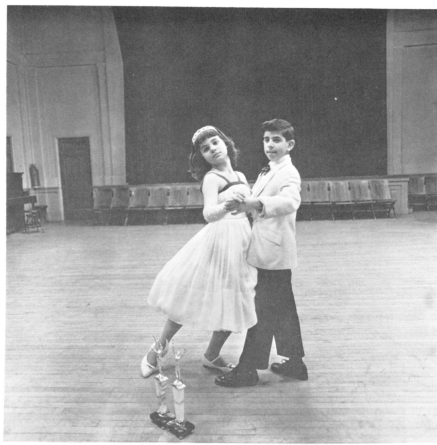
Diane Arbus. The Junior Interstate Ballroom Dance Champions, Yonkers, N.Y. 1962, photograph.