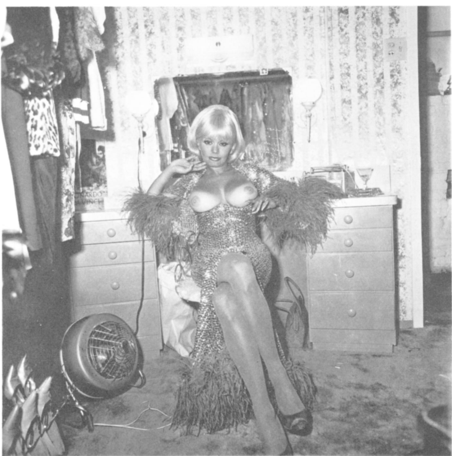
Diane Arbus, Topless dancer in her dressing room San Francisco, Cal. 1968 , photograph.