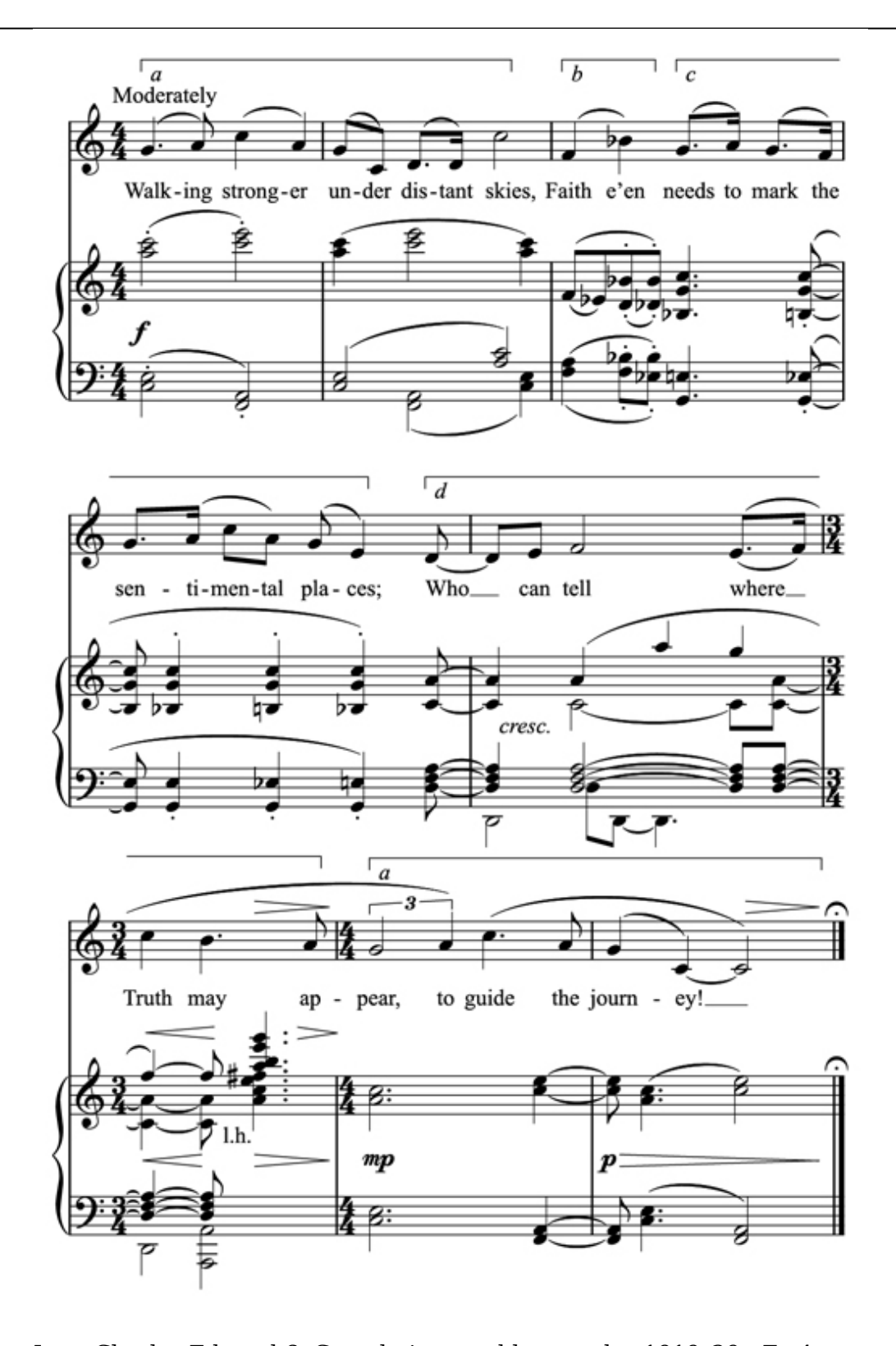
Ives, Charles Edward 6. Completions and last works, 1919–29.: Ex.4 Resolution

Between 1919 and 1921 Ives gathered most of his songs, including 20 new ones, 20 adapted to new texts, and 36 newly arranged from works for chorus or instruments, into a book of 114 Songs , privately printed in 1922. Many of the songs use words by Ives or by