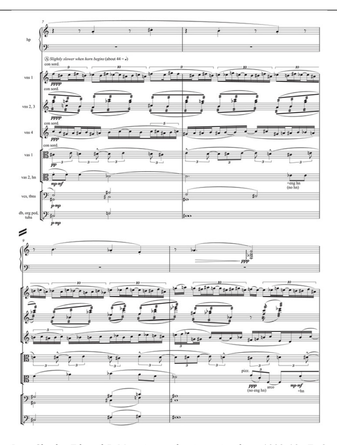
Ives, Charles Edward 5. Maturity: modernist nationalism, 1908–18.: Ex.3 The Housatonic at Stockbridge

In other works, Ives sought to capture American life, especially American experiences with music, in a more directly programmatic way. The Housatonic at Stockbridge (Ex.3) evokes a walk by the river Ives and his wife shared soon after their marriage. The main melody (given to second violas, horn, and English horn), harmonized with simple tonal triads (in the lower strings and brass, notated enharmonically), suggests a hymn wafting from the church across the river, while repeating figures in distant tonal and rhythmic regions (upper strings), subtly changing over time, convey a sense of