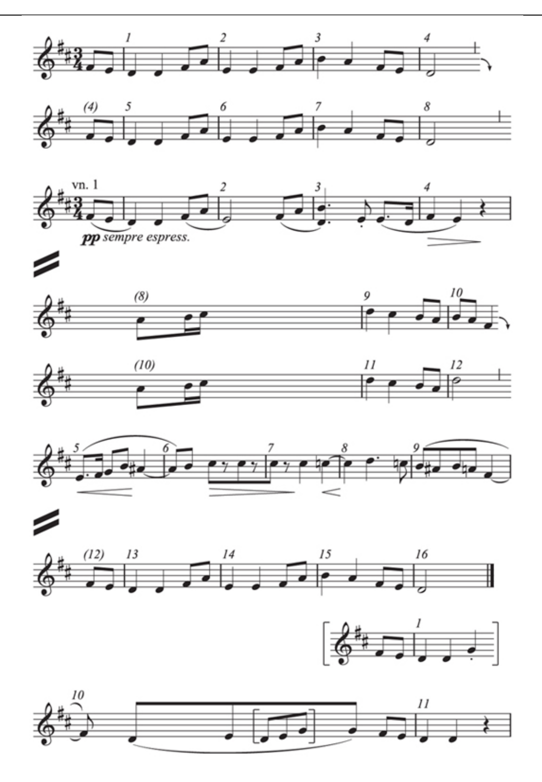
Ives, Charles Edward 3. Apprenticeship, 1894–1902.: Ex.1 Opening theme of String Quartet no.1, 3rd movt, and its source

He also pursued some new avenues. Parker had focused on German music; now Ives wrote French chansons, modeled on those of composers such as Massenet. He reworked some of the German songs with new English texts; it would become characteristic of him to reshape older pieces into newer ones, often in different media. In