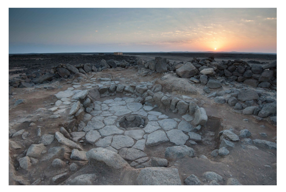
Fig. 2. The site of Shubayqa 1 showing Structure 1 and one of the fireplaces (the oldest one) where the bread-like remains were discovered.

At Shubayqa 1, a total of 24 food remains were categorized as bread-like products based on the estimation, quantification, measurement, and typological classification of plant particles and voids visible in the food matrix (Materials and Methods). From these, 22 were found in the oldest fireplace and 2 in the youngest. Macroscopically, all fragments showed a starchy, often vitrified, microstructure and irregular porous matrix, indicative of well-processed food components (Fig. 3A and SI Appendix, Figs. S1 and S8). The average size of the remains was between 4.4 mm width, 2.5 mm height, and 5.7 mm length (SI Appendix, Table S1). The basic classification system based on height measurements suggests that they probably represent unleavened flat bread-like products, as their height was <25 mm (13). This idea is supported by the size of the voids. In modern leavened breads, voids are >1 mm in size and commonly cover 40-70% of the matrix (14). The size of the voids of the bread-like remains from Shubayqa 1 was 0.15 mm on average and they were present in 16% of the matrix (SI Appendix, Table S2). These results are in agreement with finds identified as "flat breads" from several Neolithic and Roman age sites in Europe and Turkey (2, 11, 12).