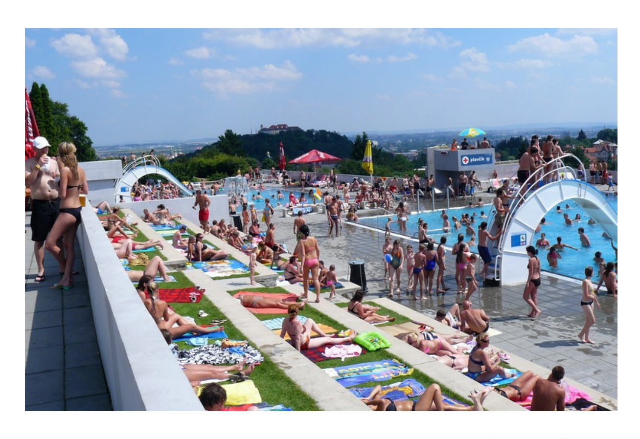
OPEN-AIR SWIMMING POOL (LIDO)