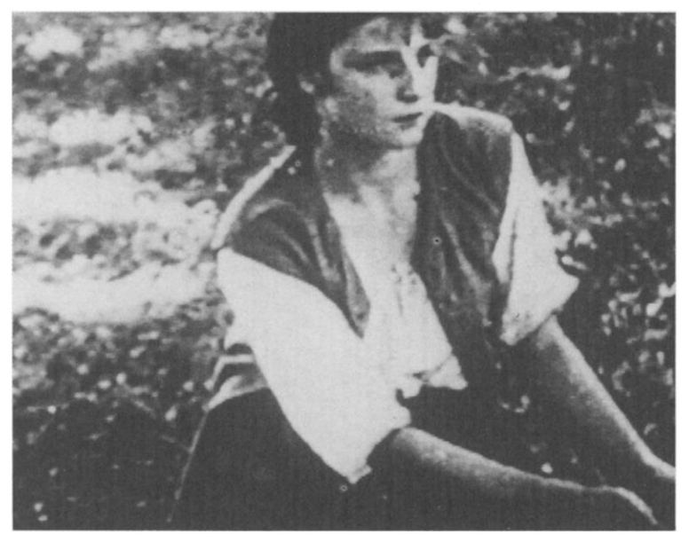
Figure 9. A frame enlargement from La Merveilleuse vie de Jeanne d'Arc that reproduces the pose depicted in figure 8

city occupied by a foreign army commanded by an officer played, again, by Modot. Moreover, both scenes were filmed at the ancient city of Carcassone and thus feature a mise-en-scène defined by the same architectural spaces, to the point, in fact, that certain shots from the two films are virtually interchangeable.