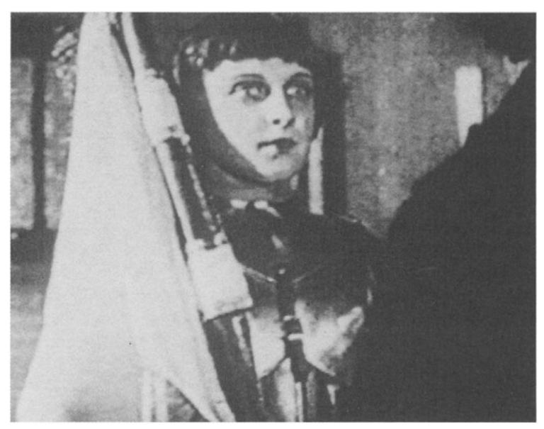
Figure 5. A frame enlargement from de Gastyne's La Merveilleuse vie de Jeanne d'Arc

moted Joan of Arc as a counterrevolutionary symbol. <sup>27</sup> The reactionary construction of Joan of Arc as the opposite of the Republic's Marianne had a precedent in the radical Left's choice of the anthem "L'Internationale" in favor of "La Marseillaise" or its commemoration of the Paris Commune rather than the taking of the Bastille. Nevertheless, because both conservative and republican forces claimed Joan of Arc, the case of Joan of Arc was especially complex, with the iconography itself the object of political struggle. Critical in defining the terms according to which conflicts concerning iconography would evolve was the guerre des manuels , a debate over the school curriculum that arose following the passage in 1905 of the Law Concerning the Separation of Church and State. Centering on issues of visual representation deriving from contradictory interpretations of the Joan of Arc narrative, the "schoolbook war" led to a high degree of iconographic codification in which slight nuances in representations of the trial or of the voices that gave Joan her mission signaled ideological differences that had come to define electoral politics in France during the years before the First World War. <sup>28</sup>