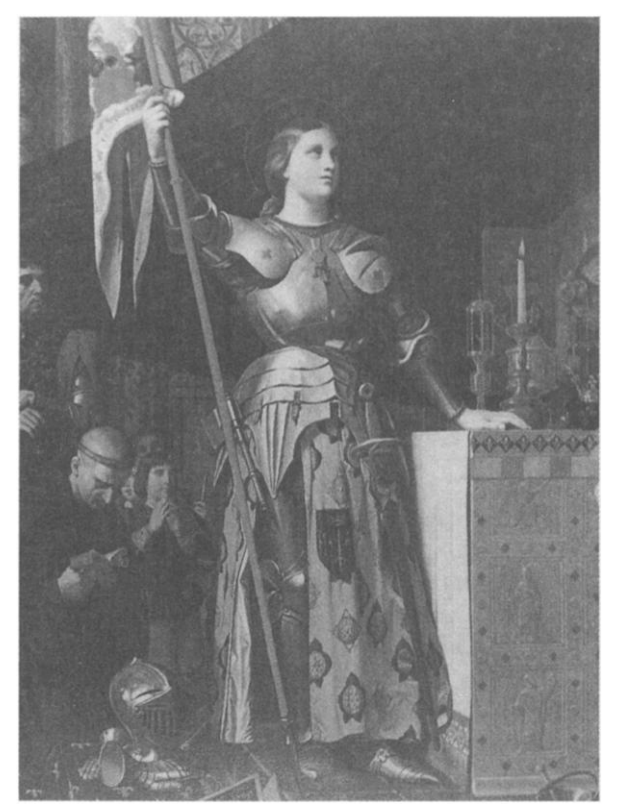
Figure 3. Ingres' painting of Joan of Arc, which has been widely reproduced in diverse media since the 1880s

the painting by Ingres, the cover of a 1928 schoolbook, and a frame enlargement from La Merveilleuse Vie de Jeanne d'Arc (figures 3, 4, and 5).