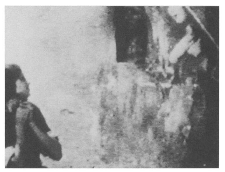
Figure 7. A frame enlargement from de Gastyne's film that appears to cite the image reproduced in figure 6\,

regimes, and a logic of repetition, in which wars and other hardships of the official past figured as manifestations of the same ageless struggle.<sup>29</sup> Marcel Oms observed that in the French films of the 1920s republican historiography is adopted in ways that convey a sense of history as recurrence. 30 In effect, all battles depicted in the films of the 1920s restage those of 1914 to 1918. A striking illustration occurs in La Merveilleuse Vie de Jeanne d'Arc during a scene following the battle of Orléans, when Joan visits the grave of her childhood friend Remy Loiseau, who was among those killed during the siege. As Joan gazes at the tombstone, the inscription, which reads "Remy Loiseau, hommes d'armes, 1429," undergoes a series of changes; while the soldier's name remains constant, the dates and names of the battles and regiments change, producing a palimpsest that moves from Orléans 1492 to Rocroy 1643, Fontenoy 1745, Valmy 1792, Montmirail 1814, and, finally, Verdun 1916.<sup>31</sup> As if to illustrate Freud's thesis concerning the role of narrative reenactment in processes of mourning, La Merveilleuse Vie de Jeanne d'Arc, like many French films of the period, reconstructs the past in order to reiterate in displaced form wartime experiences of loss and traumatic shock.