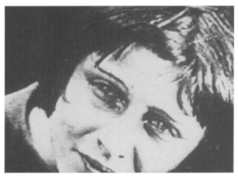
Figure 11. A frame enlargement from La Merveilleuse vie de Jeanne d'Arc that invokes Dreyer's unusual framing