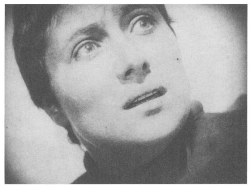
Figure 10. A frame enlargement from Dreyer's La Passion de Jeanne d'Arc

Dreyer evoke Hollywood style more so than do scenes that are organized around academic tableaux, whose flatness and stasis present a genuine formal challenge to the dynamism of Hollywood narration.