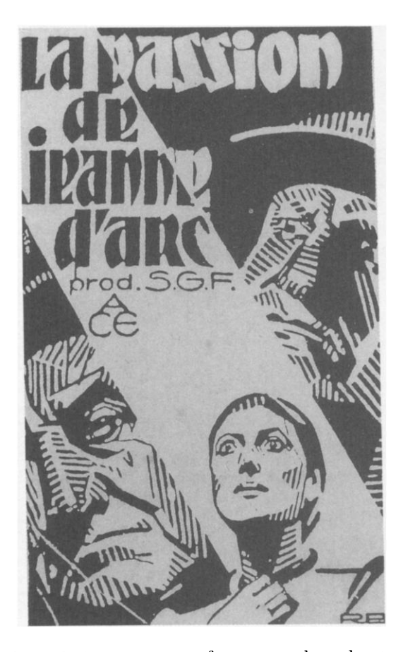
Figure 2. Among a series of posters used to advertise Dreyer's film

duties as chief executive of Pathé, reports in the trade and popular press hailed La Merveilleuse Vie de Jeanne d'Arc as proof of the capacity of the French film industry to withstand competition from Hollywood.<sup>11</sup>