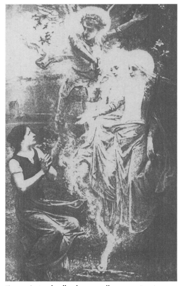
Figure 6. A schoolbook image illustrating Joan's communication with the saints

attended the hearing pass by while leaving the room. The contrast between the stylized immobility of Joan and the naturalistic movements of the other characters suggests a juxtaposition of temporalities like that proposed by Fernand Braudel, in which Joan occupies a longue durée that transcends the superficial "events" that constitute the quotidian time of political and ecclesiastical power. At such moments, Joan becomes a presence outside of the finite temporality that contains the actions of the other characters.