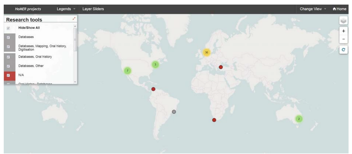
Figure 2: HoMER Projects website (homernetwork.org/dhp-projects/homer-projects-2). Screenshot.

Although research using quantitative data could be considered as more apt to comparison because of the availability of numerical data and statistical software, quite similar methodological pitfalls and challenges in terms of interoperability and incompatibility occur. In an ideal scenario with lots of quantitative data on issues like the number of cinemas, seats or box-office revenues, clear decisions are to be made at different stages of the research here as well (cf. defining hypotheses, conceptual framework, time/spatial frames, selection of