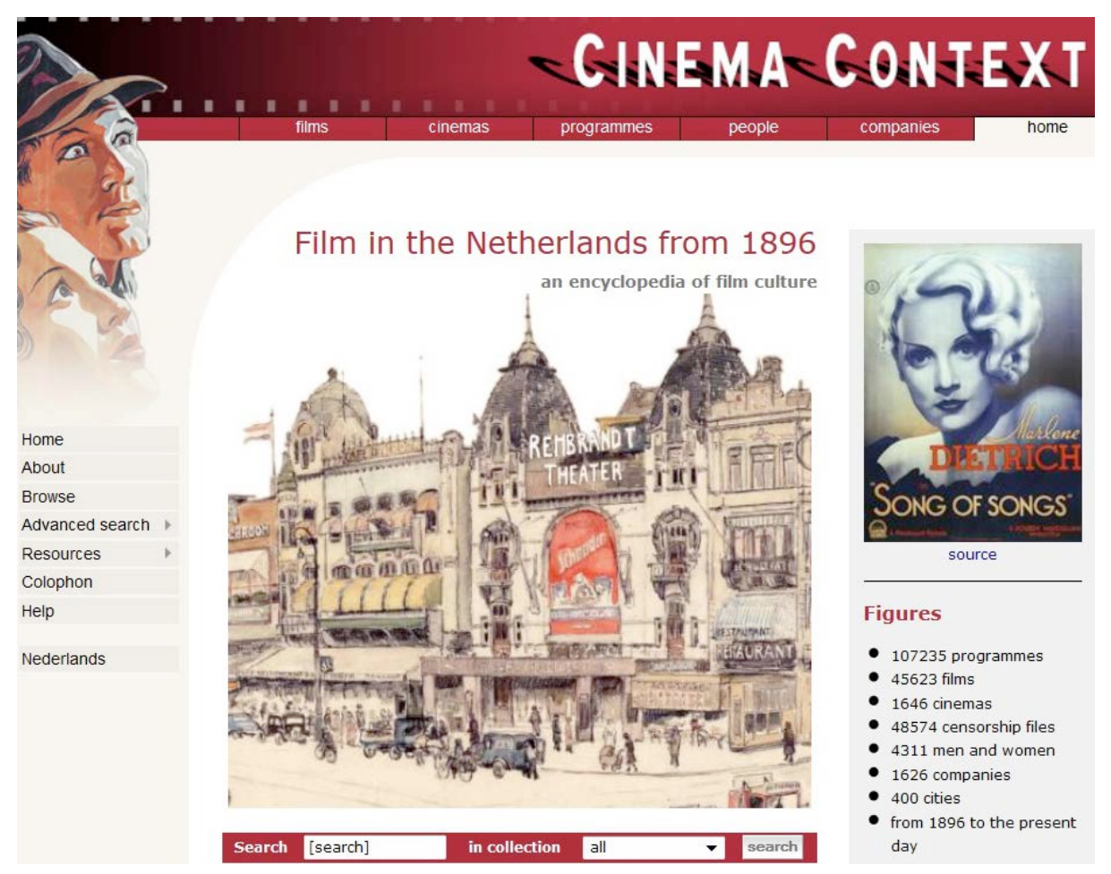
Figure 3. Opening web page of the Dutch Cinema Context project (www.cinemacontext.nl). Screenshot.

some of this work operationalised a comparison with other countries like Belgium (e.g. Convents and Dibbets) or the UK (Sedgwick, Pafort-Overduin, and Boter), Dutch film historians had a very fertile discussion on trends, factors and conditions explaining the particularities of their national cinema history (e.g. Dibbets, "Het taboe"; Pafort-Overduin, Sedgwick, and Boter; Thissen; Van Oort). The dialogic nature of Dutch historical cinema studies is interesting, not only for understanding what happened in the Netherlands. It also underlines how both cinematic and non-cinema-related conditions were important in order to grasp the larger dynamics within the Dutch film culture. Among the noncinematic conditions we find arguments on the influence of Calvinism and its view upon visual culture and cinema, the vertical stratification of Dutch society, or class, explaining how cinema had difficulties to attract middle- and upper-class audiences. Besides this mixture of religious, ideological and other societal conditions, issues related to the film industry itself were examined. Hypotheses were raised as to the impact of the severe national censorship system, heavy municipal entertainment taxes, and to the policy of the Dutch film exhibitors' association to restrict the number of cinema operations in the country (Sedgwick et al.; Thissen; Van Oort).