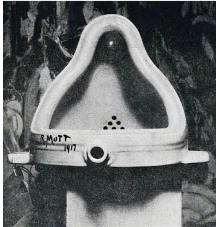
M. Duchamp's "Fountain" (1917)