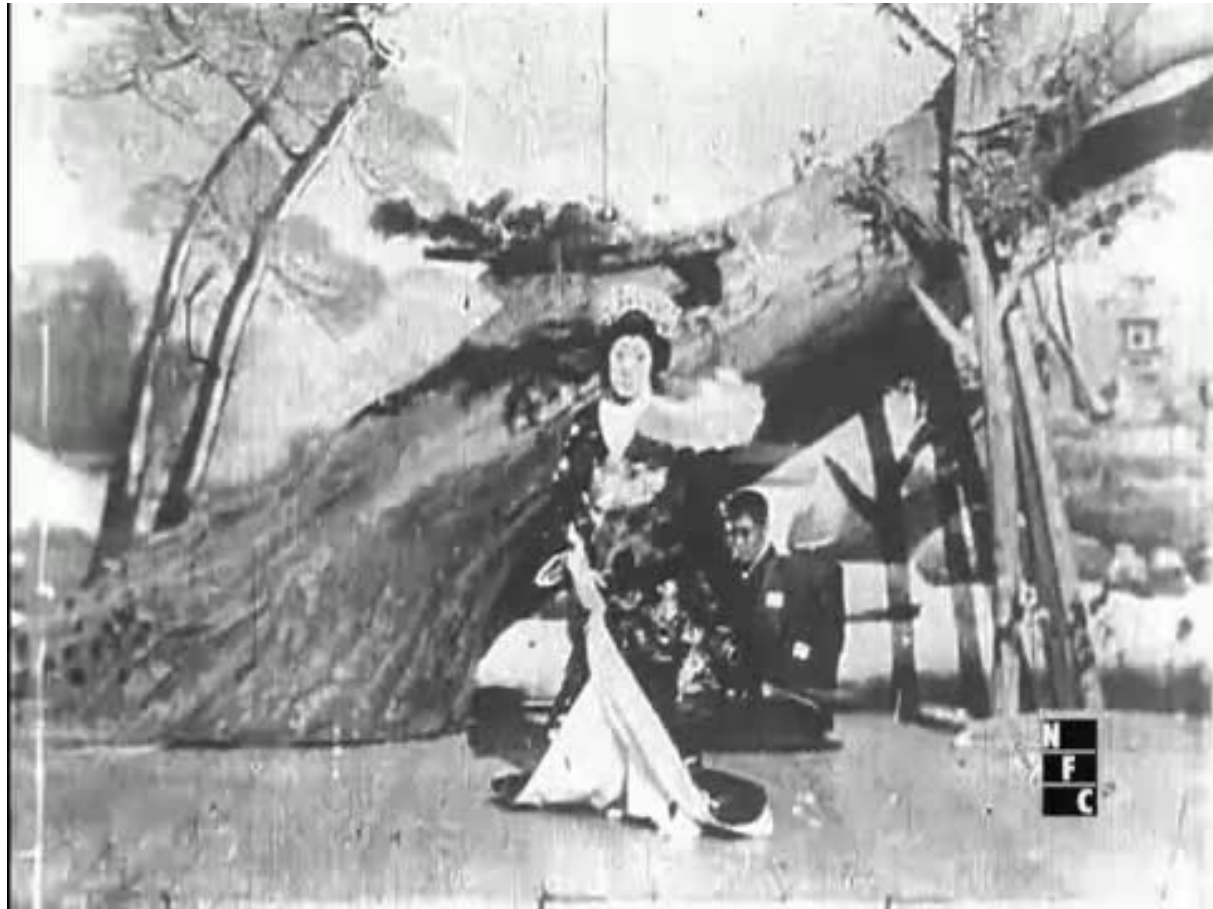
first Japanese film: a scene from kabuki play Momijigari (1899)