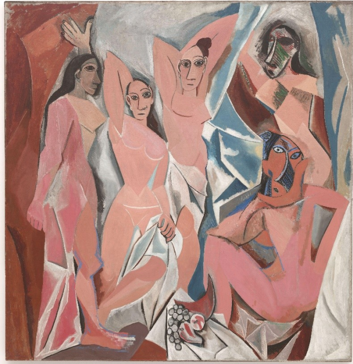
P. Picasso's Ladies from Avignon (1907)