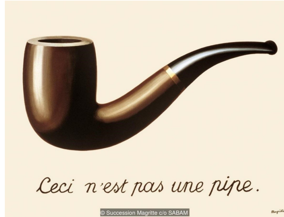
R. Magritte's "This is Not a Pipe" (1928)