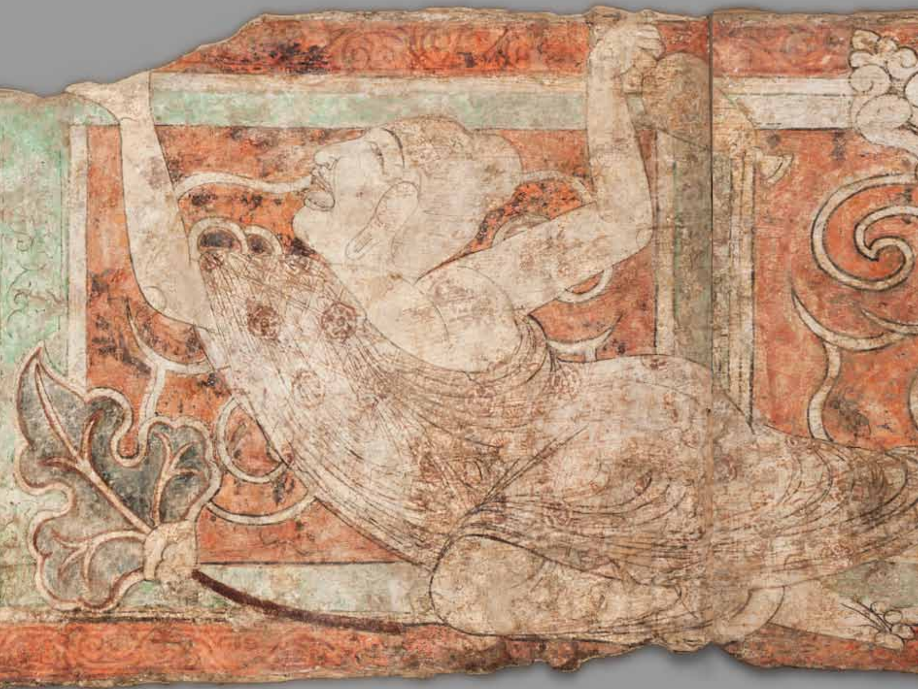
67 Fragment of a Wall Painting from the Front of the Socle of a Sculpture of Buddha Śākyamuni's Nirvana Bezeklik, Turfan, 9th century (?)