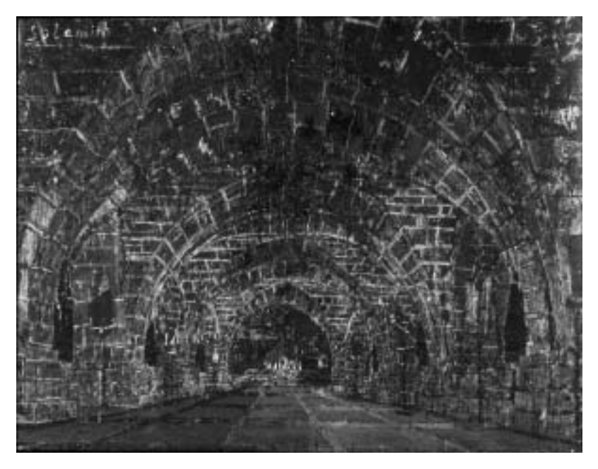
Figure 4. Anselm Kiefer, Shulamith [ Sulamith ] (1983). Oil, acrylic, emulsion, shellac, and straw on canvas, with woodcut. 114<sup>3</sup>/<sub>16</sub> × 145<sup>11</sup>/<sub>16</sub> inches. Saatchi Collection, London. Copyright 2003 Anselm Kiefer.

how it can transform itself into an entire range of opposites, including, but not limited to, "abstract surface," "drawing," "language," and "natural object." And in this way, the formal and existential reflexivity produced by Kiefer's work interacts with its undecidable citations to suggest both the difficulties and the necessity of remembering and depicting the past. Historical trauma, Margarete suggests, cannot be represented unequivocally or even statically. It can—and must change over time. By working through the dense network of cultural representations that connect the present day with the past, however, those who come after may remember and commemorate monstrous and largely unrepresentable events of historical trauma through representations that acknowledge—and thereby contribute to—a process of continuous dialogue and investigation.