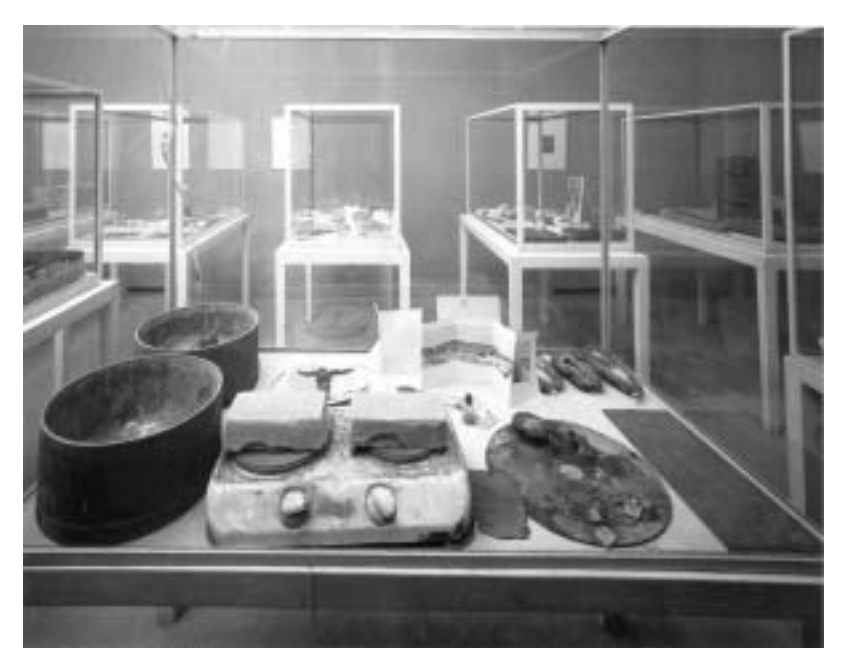
Figure 2. Joseph Beuys, Auschwitz Demonstration [ Auschwitz Demonstration ] (1968). Vitrine with sculpture and objects (1956 to 1964). Hessisches Landesmuseum, Darmstadt. Copyright 2003 Artists Rights Society (ARS), New York/VG Bild-Kunst, Bonn.

such representations often juxtapose different historical time frames and forms of signification—juxtapositions that provoke their spectators to compare and contrast different temporal and spatial contexts. "Reflexivity" here means physical and existential viewer selfconsciousness evoked by a particular set of visual and linguistic signifiers—a self-awareness that asks the viewer to engage with the artist's representation and its relationship to the environments and life contexts to which it refers and through which it passes. As such, reflexivity is connected to the attempt to dissolve art into life and, thus, potentially, has political consequences.