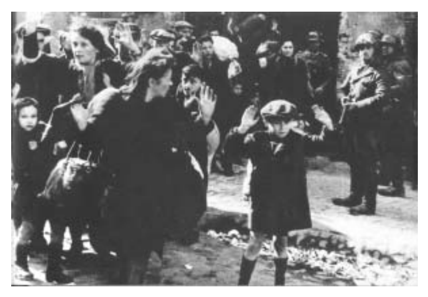
Figure 1. Photographer unknown, Warsaw Ghetto (1943). From the Stroop Report.

jects, its detail, and its unrehearsed documentary character (conveyed, for example, by the somewhat haphazard organization of the human figures as well as the multiple directions of their gazes), it suggests the truth or actuality of these events. Moreover, because of the clear power discrepancies between the victimizers and the victims (emphasized by the prominence of Jewish women and children in the photograph), it (still) provokes outrage at Nazi atrocities. By selecting the most innocent victims of the Holocaust-the children, who in no way could be considered combatants-it shows the utter senselessness and viciousness of the Nazis' projects. Furthermore, as Marianne Hirsch has argued, the image of the child encourages viewer identification and projection.<sup>14</sup> Such images, she argues, can open up spaces for "postmemory," acts of spectatorial identification with the oppressed other, which do not either stereotype or fully assimilate him or her, and that help those who were born after the events develop an open and ethical relationship to the past.<sup>15</sup>