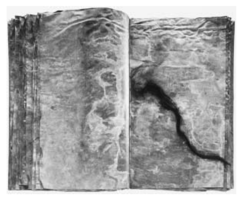
Figure 6. Anselm Kiefer, Shulamith I [ Sulamith I ] (1990), pp. 32–33. Book, 64 pages. Soldered lead and woman's hair. 39\frac{3}{4} \times 24\frac{3}{4} \times 4\frac{5}{6} inches. Private Collection. Copyright 2003 Anselm Kiefer.

ical and conceptual), Kiefer's work also suggests that technology is not neutral or value free and that its rapid development in the nineteenth and twentieth centuries may have changed human behavior for the worse.<sup>59</sup> Through its support of these multiple frames of reference, Iron Path shows the memory of the Holocaust to be alive as a creative and discursive practice.