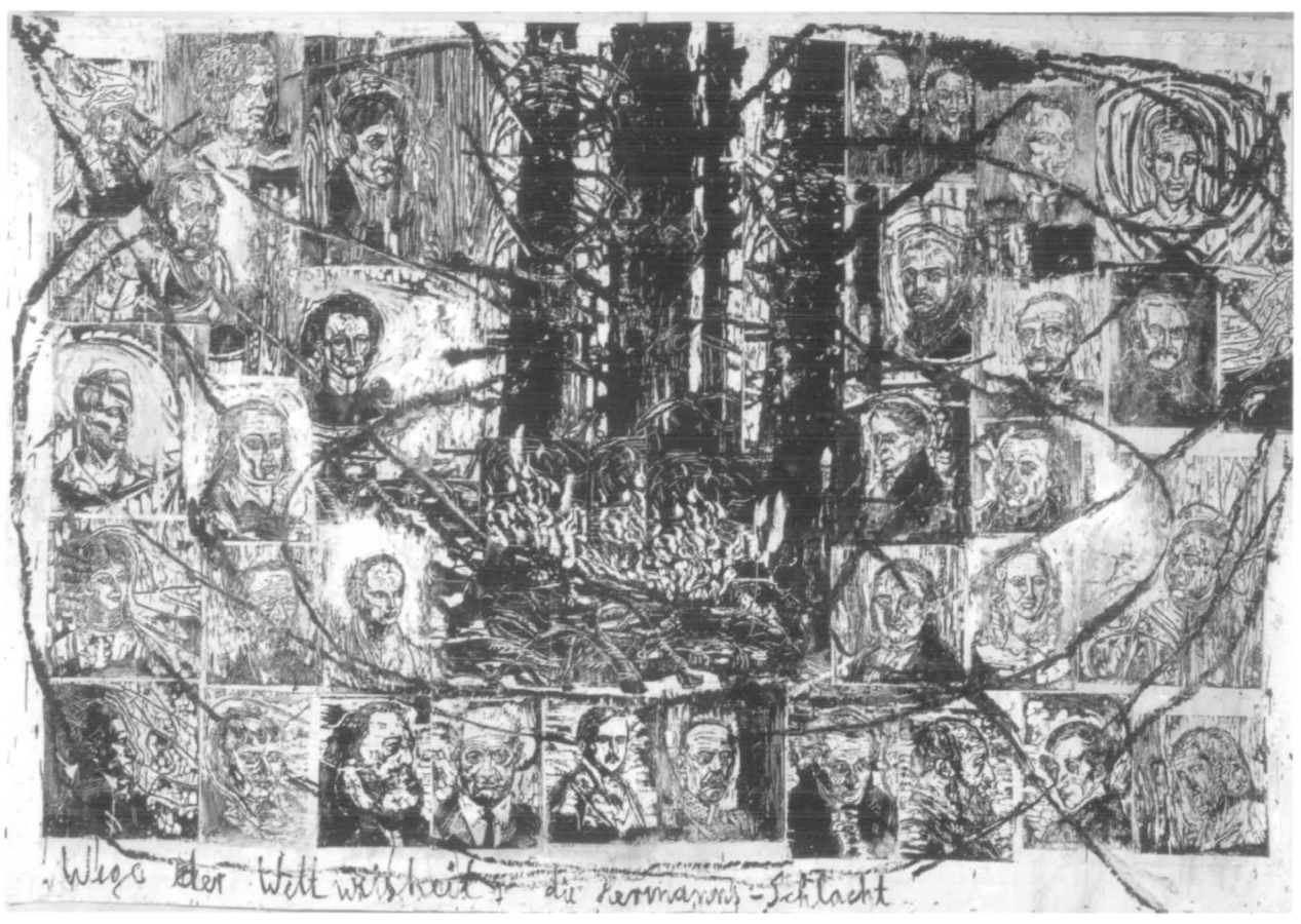
Fig. 4. Anselm Kiefer: Ways of Worldly Wisdom - The Hermanns-Schlacht, 1978–80, woodcut with acrylic and shellac, mounted on canvas, 320 × 500 cm. (Photograph: Anselm Kiefer, © DACS.)

light Karl Jaspers's comments on the inherently authoritarian nature of Heidegger's philosophy are not unimportant.<sup>52</sup>