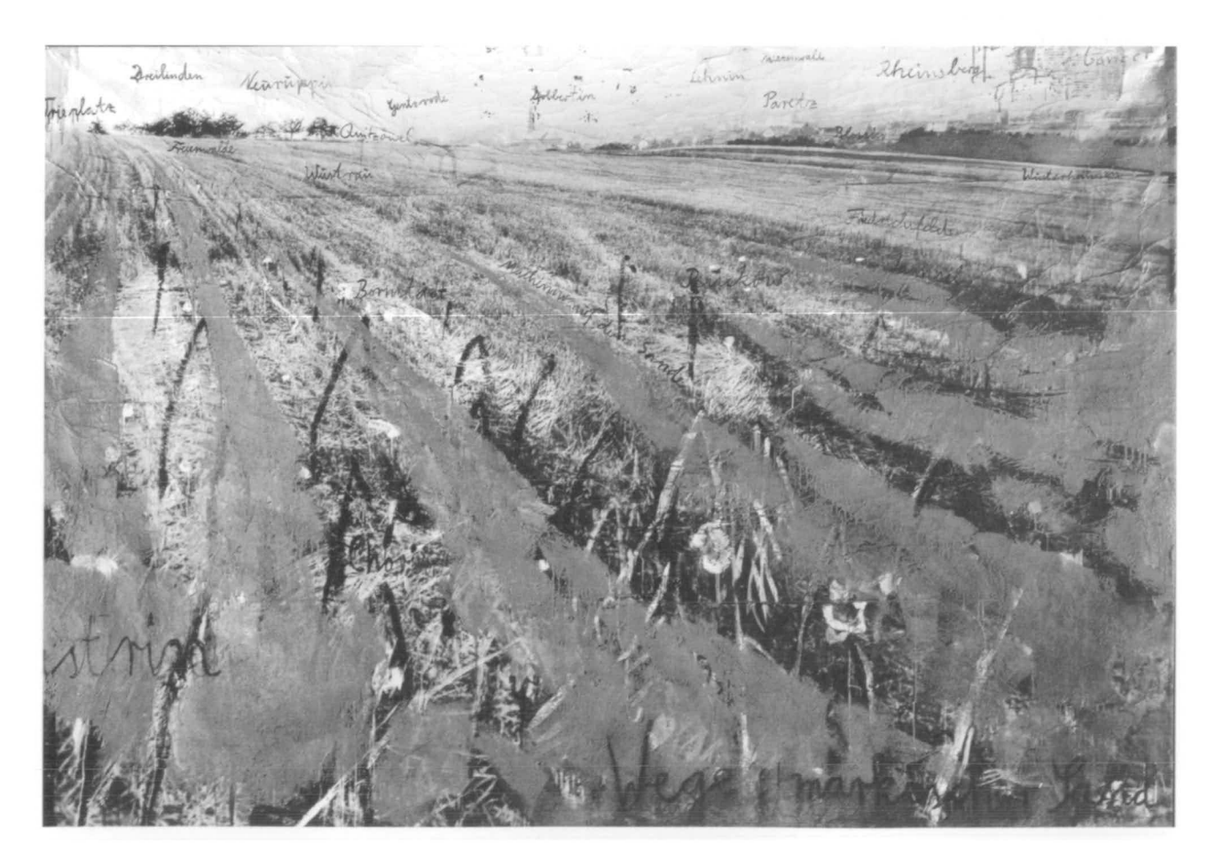
Fig. 6. Anselm Kiefer: Ways: March Sand, 1980, acrylic and sand on photograph, mounted on burlap, 255 × 360 cm. (Photograph: Anselm Kiefer, © DACS.)