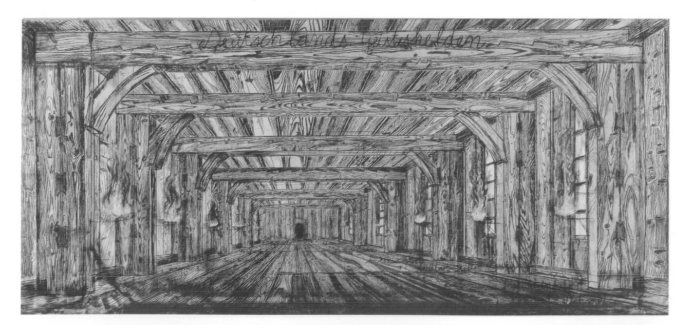
Fig. 2. Anselm Kiefer: Germany's Spiritual Heroes, 1973, oil and charcoal on burlap, mounted on canvas, 307 × 682 cm. (Photograph: Anselm Kiefer, C DACS.)

These paintings, with their appeal to a pastoral pre-history, foreground in particular the notion of the pastoral as the arboreal. This recalls the