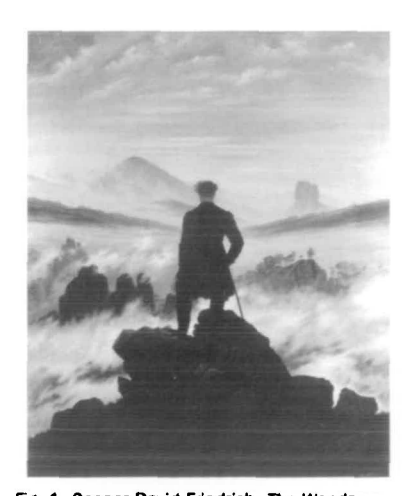
Fig. 1. Caspar David Friedrich: The Wanderer over the Sea of Mist, 1818, oil on canvas, 98.4 × 74.8 cm.