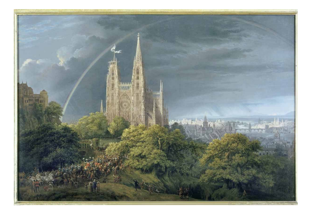
Figure 2. Karl Friedrich Schinkel (1781–1841). Mittelalterliche Stadt an einem Fluss (1815). Oil on canvas, 95×140.6 cm. Berlin, Nationalgalerie, Staatliche Museen zu Berlin.

Considerations of the Gothic in contemporary studies concerned specifically with architecture, however, tended to be historicizing (Frankl 466–67; Germann 93; Kruft 290–92, 296–97), and the style did not in fact become dominant, let alone normative, when building projects could again be undertaken after 1815. By far the most significant German Gothic structure built during the century was the portion of Cologne Cathedral that had remained unbuilt since the fifteenth century.<sup>3</sup> That the cathedral, whose "ruinous incompletion" Görres had interpreted as a symbol of the unrealized unitary German state (2), was completed in 1823–1880, was overdetermined by the conflicting ideological interests of Rhenish Catholics like Reichensperger, who wanted to preserve a sense of cultural distinctness in the face of the post-1815 Prussian annexation of the Rhineland, and of the Protestant Prussian crown, which wanted to secure the loyalty of its new subjects (Lewis 11, 34–42).