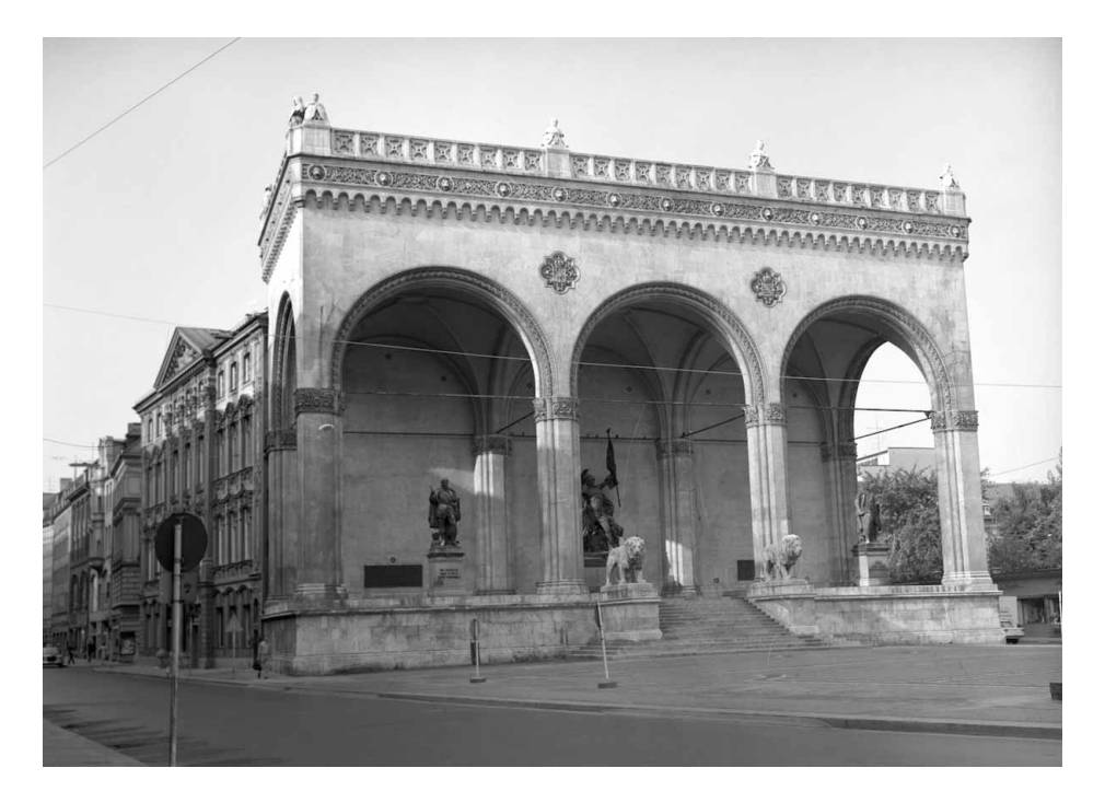
Figure 1. Friedrich von Gärtner. Feldherrnhalle, Munich (1841–1844).