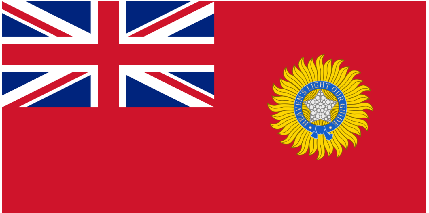
BRITISH RAJ (1858-1947) Jewel in the Crown