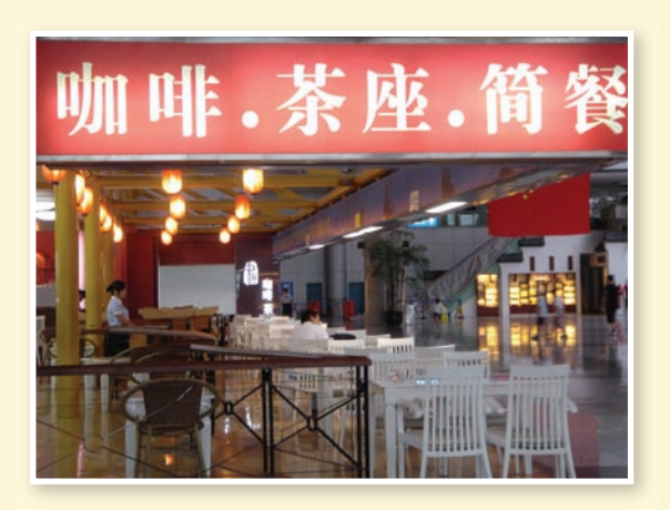
Should this sign be read from the left to the right or from the right to the left?