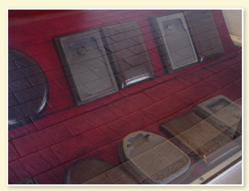
This is a window display of a store specializing in ink stones.