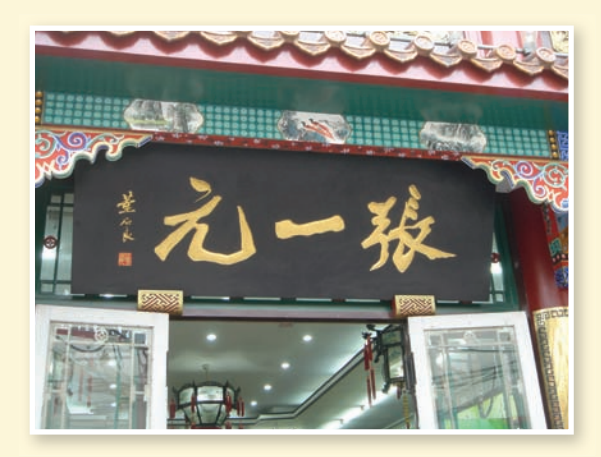
This is a store sign which was commissioned more than one hundred years ago. It is read from right to left, and it's the name of the person who established the store. Can you recognize his family name?