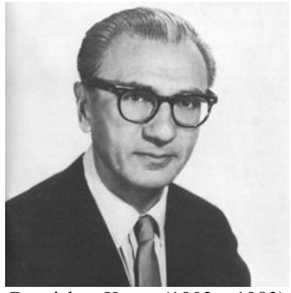
Bronislaw Kaper (1902 – 1983)