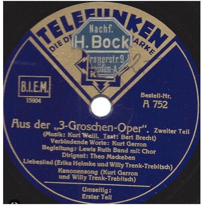
Původní vydání po světové premiéře v Německu