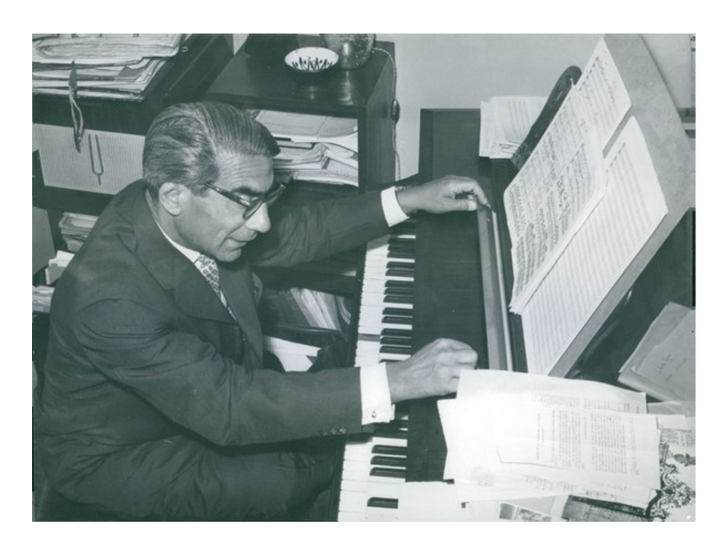
Joseph Kosma [József Kozma] (1905 – 1969)