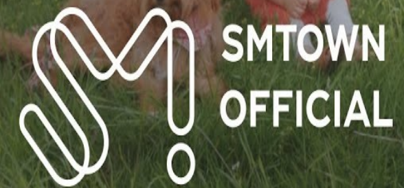
Red Velvet Joy - Hello