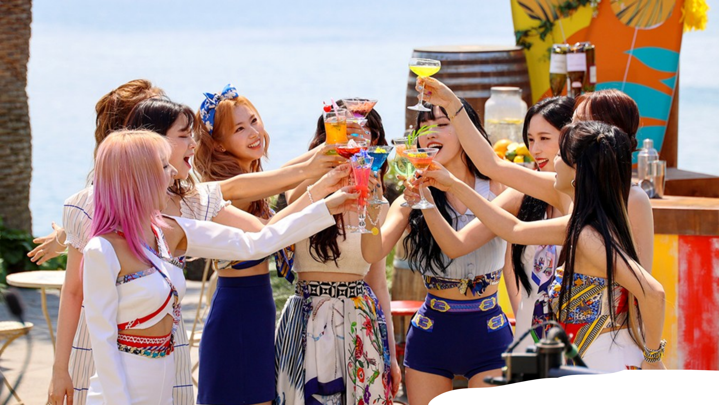
Twice - alcohol free