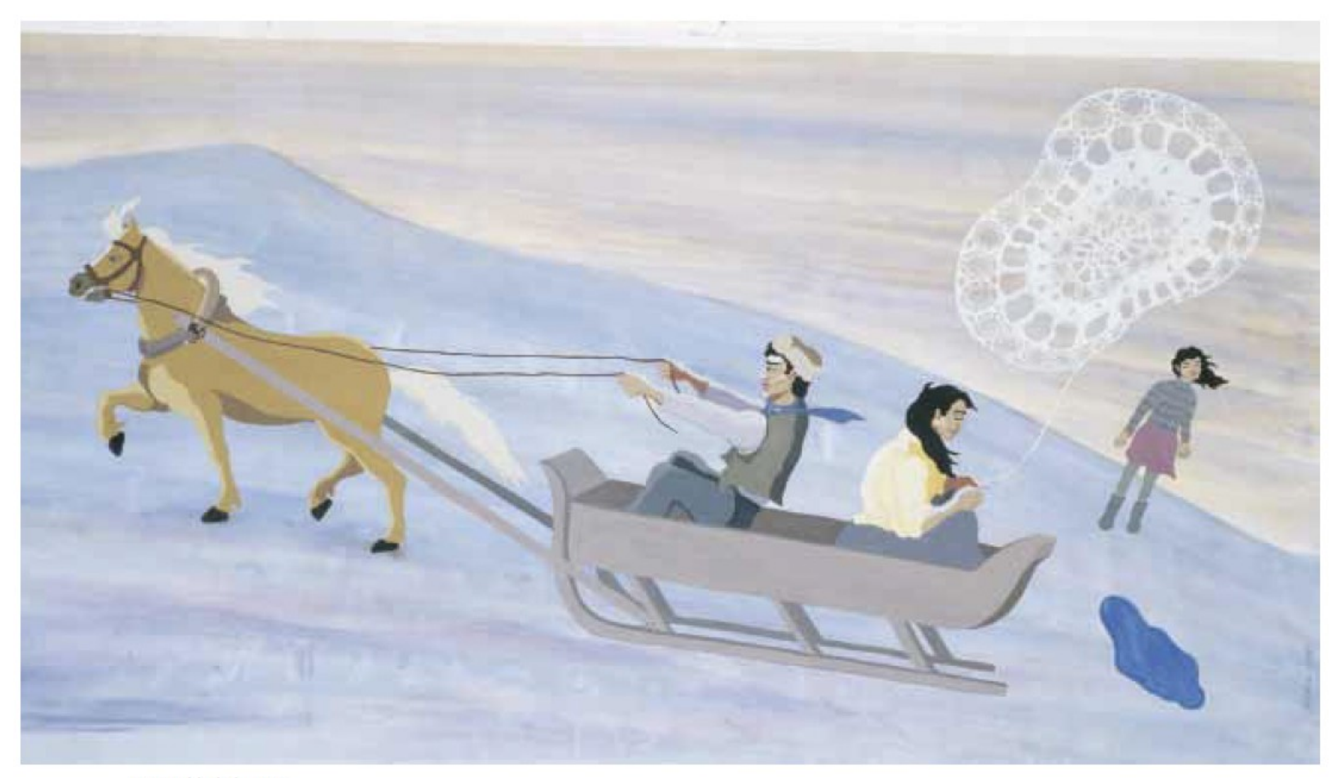
Lace Tablecloth, 1995 gouache, 50 x 88 cm, National Bureau of Antiquities, The Archives for Prints and Photographs, Finland