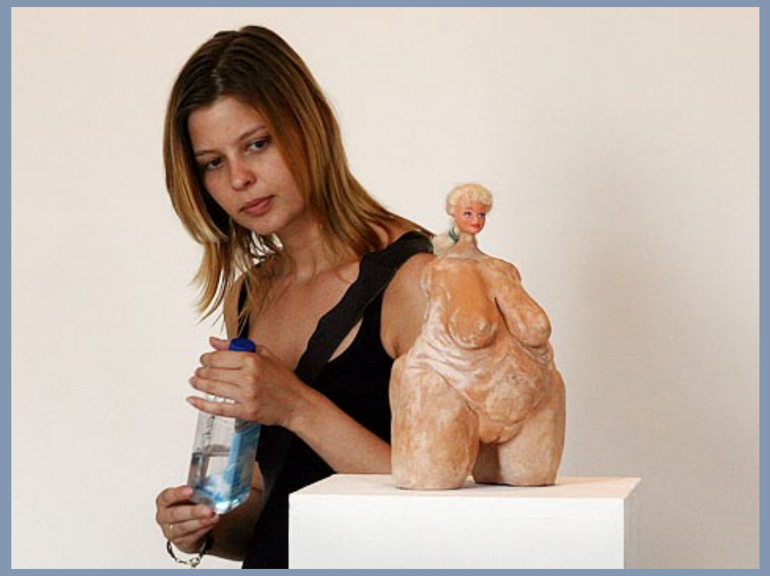
András Kállai, Fat Barbie. 2006, Terracotta, plastic, 28 x 13 x 14 cm, http://universes-in-universe.de/car/venezia/eng/2007/tour/roma/img-19.htm

I want to represent the Barbie doll in certain situations, with the use of simple symbols. The works that emerged along this concept may at first sight be perplexing, even funny, but it is my hope that they are attention-arresting.