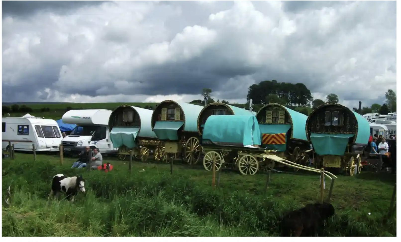
■ Traditional bow-top caravans at Appleby Fair.