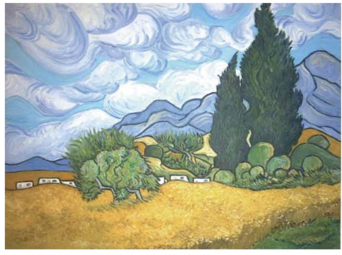
Caravans and the Cypresses, 2001 oil on canvas, 80 x 60 cm, collection of the artist