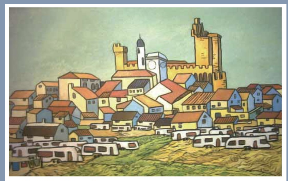
Saintes Maries de la Mer 3 – The Caravans, 2002 oil on canvas, 73 x 116 cm, collection of the artist