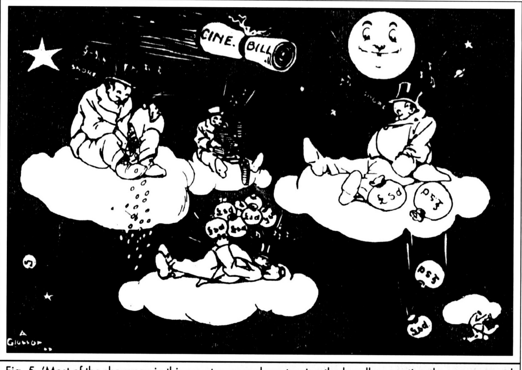
Fig. 5. 'Most of the showmen in this country are so busy turning the handle, counting the money – and sleeping – that the Cinematograph Bill is passing through unnoticed'. From The Bioscope 2 September 1909.

a contentious Bill and it was certain to receive crossparty support.