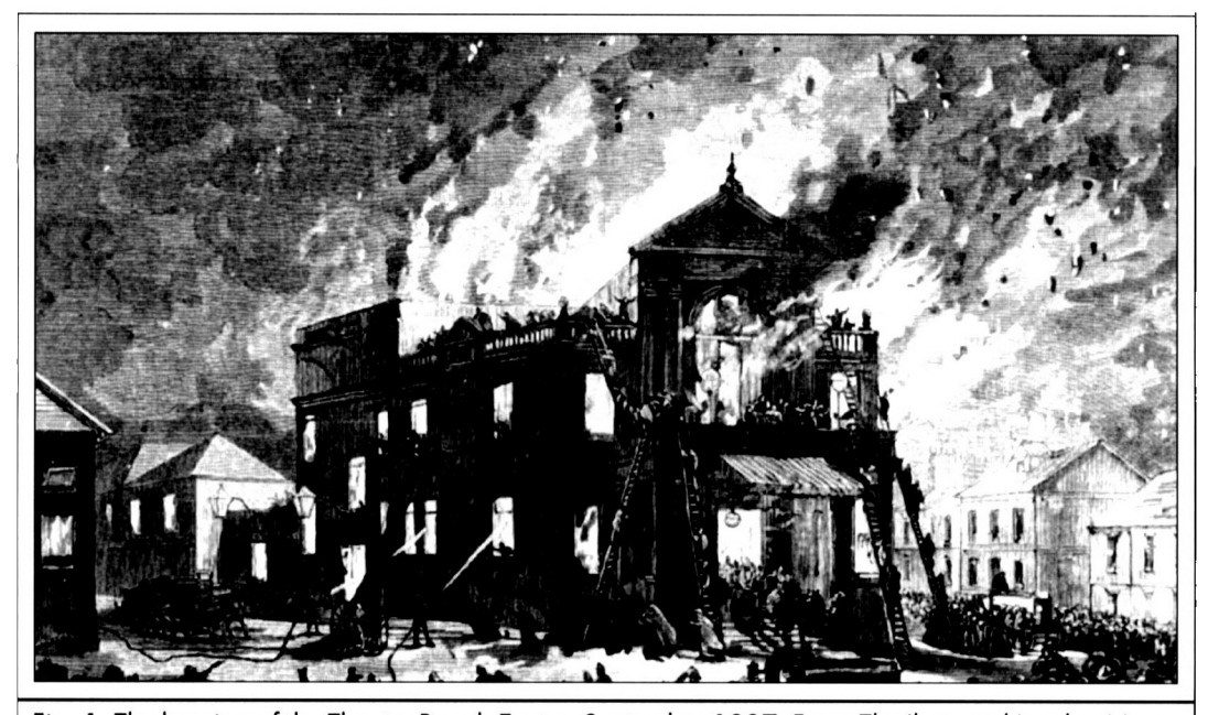
Fig. 1. The burning of the Theatre Royal, Exeter, September 1887. From The Ilustrated London News , 10 September 1887.

lighted gas jet projected onto a lump of lime held in a clamp produced an intense white light. Though the commonest illuminants were controlled mixtures of acetylene and oxygen, or oxygen and hydrogen, other more volatile gases such as ether could be employed. Theatrical fires often caused by exploding limelight fixtures were commonly reported long before the invention of the cinematograph. The destruction of the Theatre Royal, Exeter was sufficiently alarming to be featured in The Illustrated London N ews of 10 September 1887.