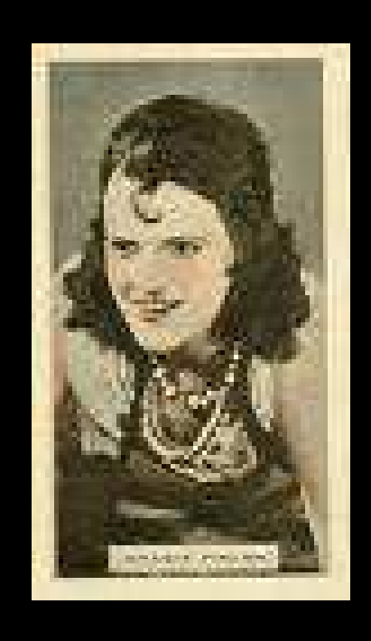
Gracie Fields cigarette card