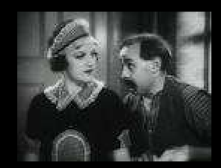
Fields in Sing As We Go