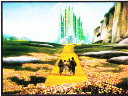
2.9 Centered in the upper half of the frame, the Emerald City creates a striking contrast to . . .