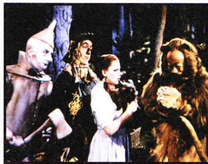
2.6 As the Lion describes his timidity, the characters are lined up to form a mirror reversal of . . .