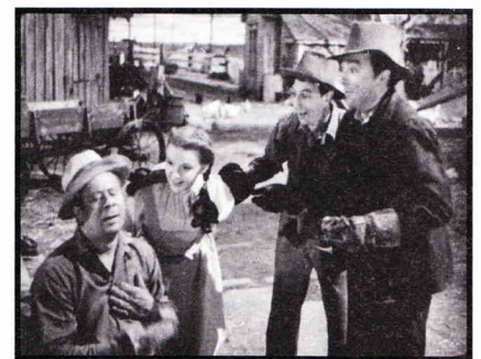
2.7 . . . the earlier scene in which the others teased Zeke for being afraid of pigs.

and the Scarecrow, the Tin Man, and the Cowardly Lion. We must notice additional echoes between characters in the frame story and in the fantasy (2.2–2.5). The duplication isn't perfect, but the similarity is very strong. Such similarities are called parallelism , the process whereby the film cues the spectator to compare two or more distinct elements by highlighting some similarity. For example, at one point, Dorothy says she feels that she has known the Scarecrow, the Tin Man, and the Cowardly Lion before. At another point, the staging of a shot reinforces this familiarity (2.6, 2.7).