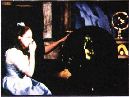
2.8 Through her crystal ball, the Wicked Witch mocks Dorothy.