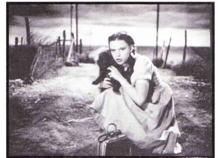
2.1 Dorothy pauses while fleeing with Toto at the beginning of The Wizard of Oz .

One more pattern of our expectations needs tracing. Sometimes an artwork will cue us to hazard guesses about what has come before this point in the work. When