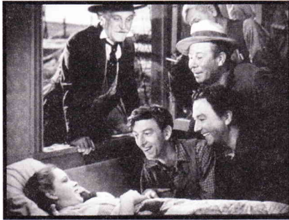
2.12 The visits of the final scene.

Earlier, we suggested that film form engages our emotions and expectations in a dynamic way. Now we are in a better position to see why. The constant interplay between similarity and difference, and repetition and variation, leads the viewer to an active, developing engagement with the film's formal system. It may be handy to visualize a movie's development in static terms by segmenting it, but we ought not to forget that formal development is a process . Form shapes our experience of the film.