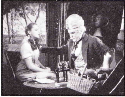
2.2 The itinerant Kansas fortune-teller, Professor Marvell, bears a striking resemblance to . . .