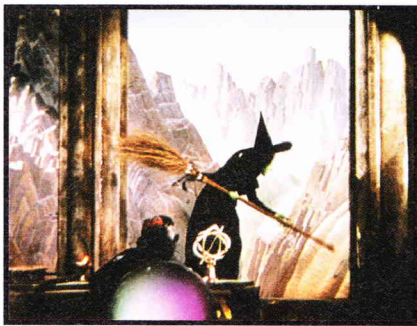
2.5 . . . the Witch's broom in Oz.