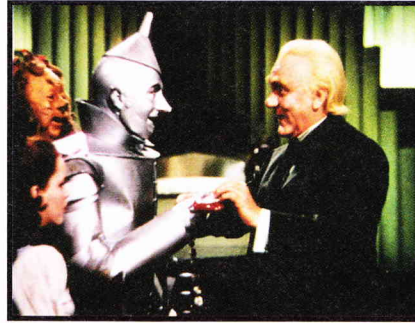
2.3 . . . the old charlatan known as the Wizard of Oz.