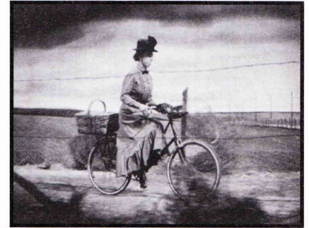
2.4 Miss Gulch's bicycle in the opening section becomes . . .