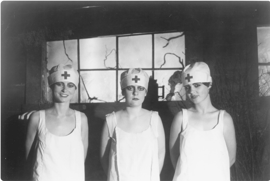
Figure 2. Tales from Gimli Hospital (1988) by Guy Maddin

Fire . The film, an Indian-Canadian coproduction, was shot in India and explored a lesbian relationship between two married Indian women. The film's Canadianness was called into question by numerous institutional bodies, including the media, which questioned the "ethnic" slant of the programming choice. In addition, Telefilm Canada initially hesitated funding the distribution of Fire as it didn't fulfill the requirements to be deemed Canadian. (For Telefilm Canada's purposes, a film's Canadianness is evaluated on a point system according to the nationality of talent and craftspeople involved with the film.)