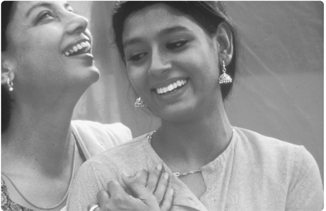
Figure 1. Fire (1996) by Deepa Mehta

process of programming a festival. Selection decisions made regarding the canon sometimes correspond strongly with the kind of evaluative judgments made in programming. But before turning to this relationship, the other processes of canonization that Staiger proposes, such as scholarly film histories and popular criticism, merit consideration.