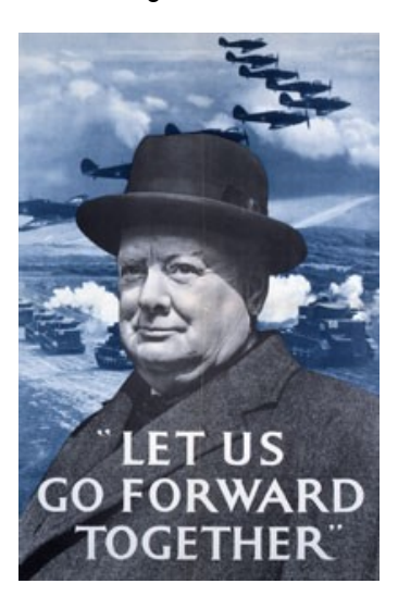
Task 4 : Compare the two drafts of a letter from Churchill on area bombing and answer the following questions:

Some historians have argued that this attack was not justifiable on military grounds, that it was nothing more than a slaughter of civilians. But others say it helped to shorten the war in Europe. Ultimate responsibility for this attack lay with the British Prime Minister, Winston Churchill. Was the bombing of Dresden a justifiable act during wartime? Does this cast a shadow upon Churchill's reputation as the heroic icon of twentieth century British history?