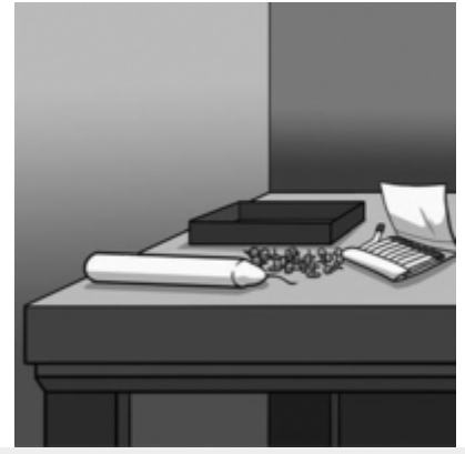
Fig. 1. The Duncker candle problem presented to participants in Experiment 1.

the box of tacks, tack it to the wall, and then place the candle inside. Finding the correct solution is considered a measure of insight creativity because it requires people to see objects as capable of performing atypical functions (Maddux & Galinsky, 2009). Thus, the hidden solution to the problem is inconsistent with the preexisting associations and expectations individuals bring to the task (Duncker, 1945; Glucksberg & Weisberg, 1966).