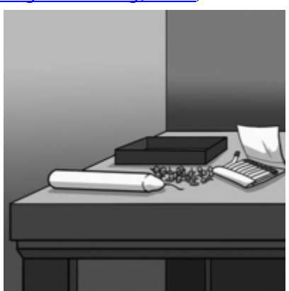
Fig. 1. The Duncker candle problem presented to participants in Experiment 1.

candle to the wall so that the candle burns properly and does not drip wax on the table or the floor." The correct solution involves using the box of tacks as a candleholder: One should empty the box of tacks, tack it to the wall, and then place the candle inside. Finding the correct solution is considered a measure of insight creativity because it requires people to see objects as capable of performing atypical functions (Maddux & Galinsky, 2009). Thus, the hidden solution to the problem is inconsistent with the preexisting associations and expectations individuals bring to the task (Duncker, 1945; Glucksberg & Weisberg, 1966).