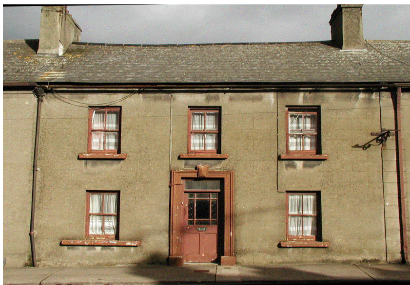
Modest street building, William Street, Wexford What values can be ascribed to this building?

Keeping buildings out of landfill dumps by not demolishing them is, ipso facto , an environmental benefit. It has been said that ‘... the most environmentally benign building is the one that does not have to be built ’, a sentiment that must surely resonate in the solvent-filled nostrils of anyone with an environmental sensibility who ever walked onto a building site. The question is how can the ordinary buildings structure, with all its cultural associations and value (pleasing aesthetic proportions, contribution to the streetscape, support for neighbouring building, proven longevity of materials and environmental modifications systems like the sash windows, etc), be put to a new use with its cultural values intact?