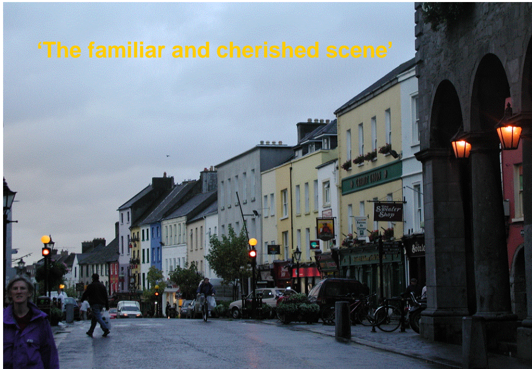
High Street and the Tholsel, Kilkenny