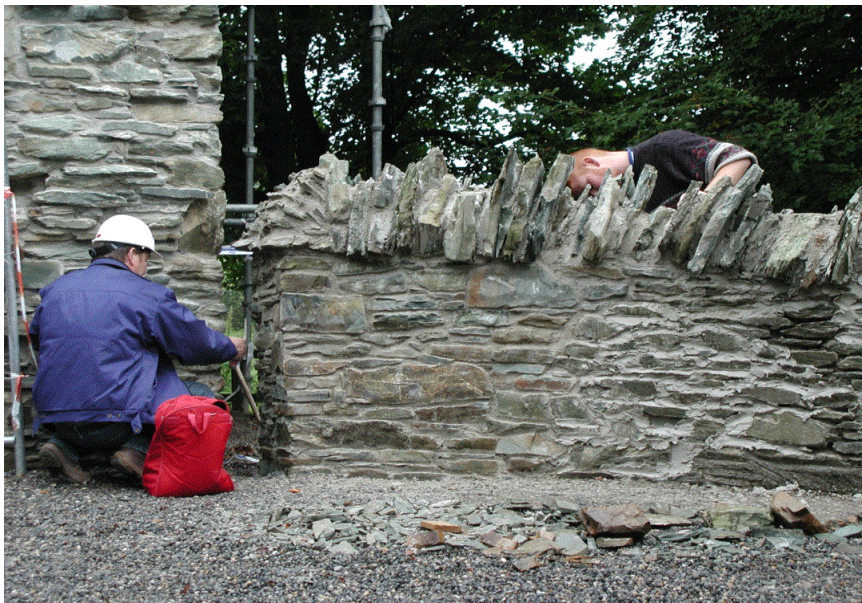
Re-pointing a wall in lime mortar, Moone, Co. Kildare. 2002

Conservation projects more complex, require skills at many levels, from tradesman to supervisor to architect. This means that if we as a society give an economic value to a certain type of work that requires skills (rather than machines) to achieve its ends, the capacity to deliver this quality of outcome remains with the person who carries it out. Thus, it remains in the local economy, capable of delivering an aspect of quality of life in the future.