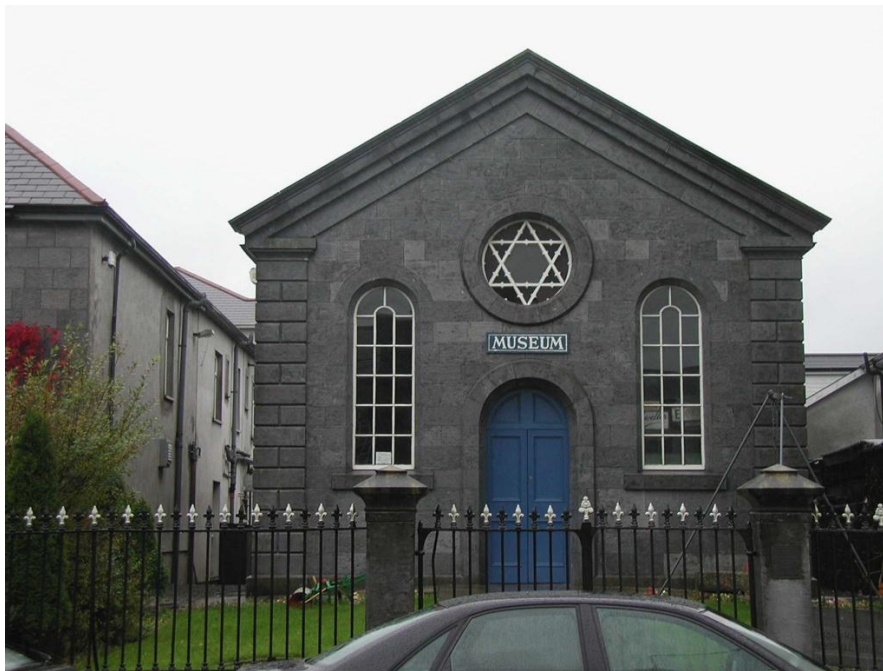
Roscommon Museum, formerly a Presbyterian church

Many people buy older properties for their prestige value, based on their cultural and heritage value. They express a preference for higher-quality areas in which to live or work, such as Merrion Square, Dublin. In an Irish small town, the museum is likely to be a re-used building that was built for another purpose.