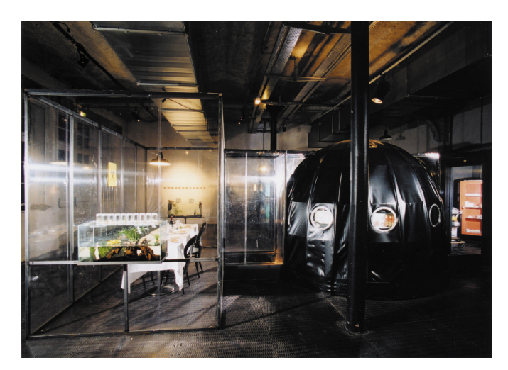
Figure 1. The Tissue Culture & Art Project, Disembodied cuisine (2003). Installation, Nantes, France.

One more complication arising from the Extended Body as a manifestation of the techno-scientific project is that it may create an illusion of a victimless existence. There is a shift from "the red" in the teeth and claws of nature to a mediated nature. The victims are pushed farther away; they still exist, but are much more implicit.