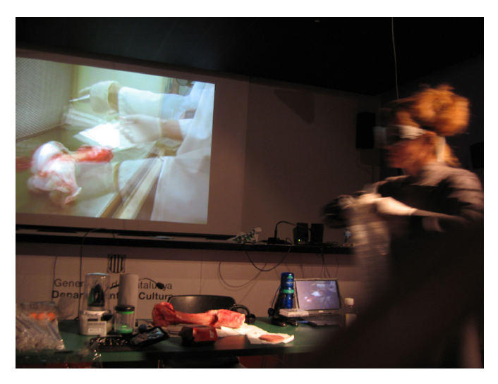
Figure 3. The Tissue Culture & Art Project, The DIY De-victimizer (2006). Performance.