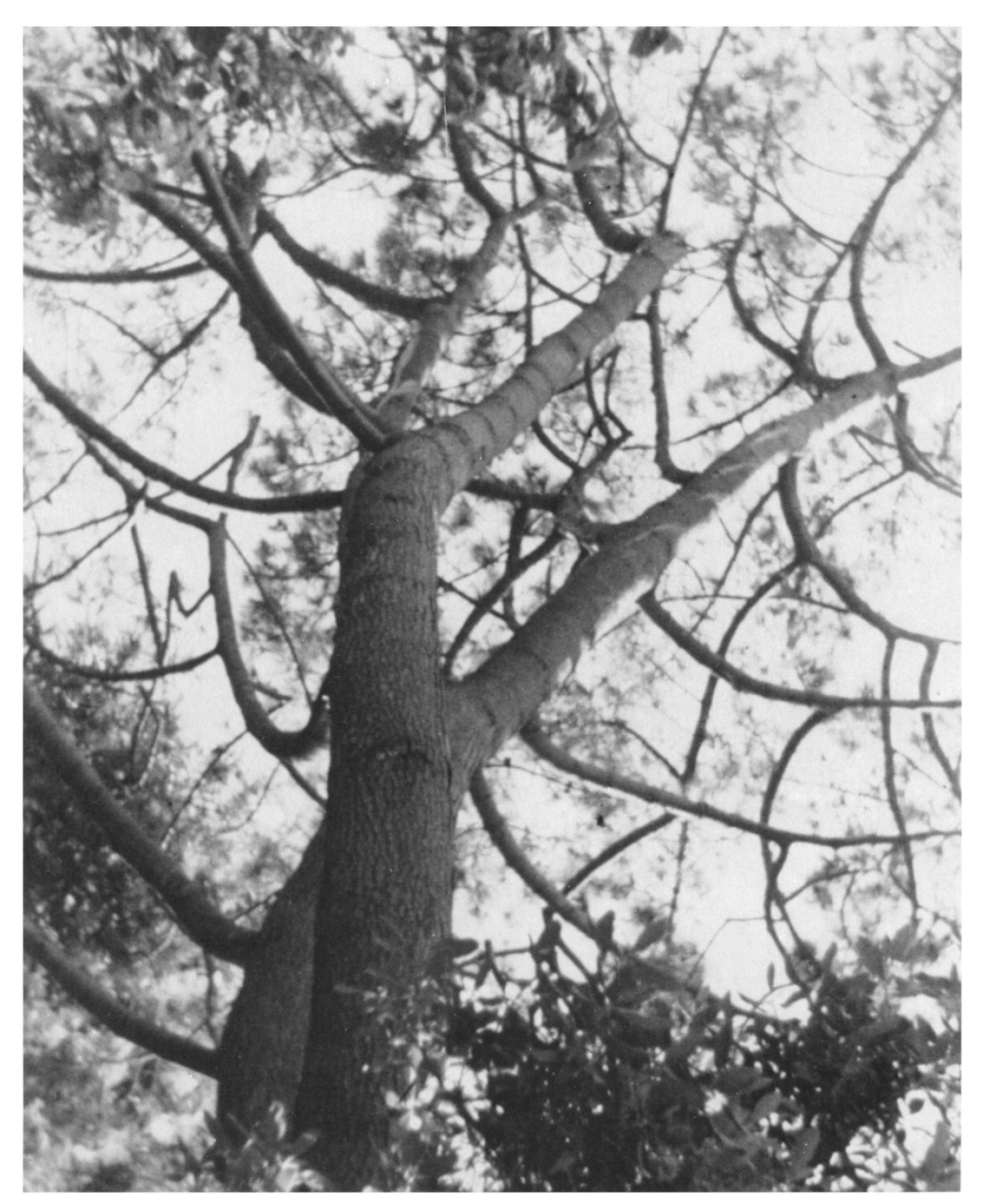
Hamblen. Tree on Green Hills. Photograph.