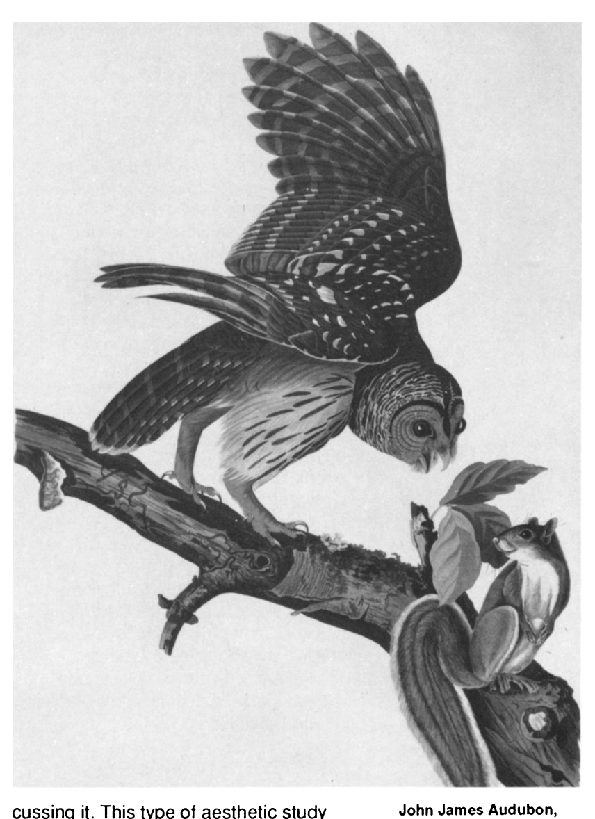
involves a highly elaborated and complex verbal language and visual language of recognition, analysis, analogy, transposition. Aesthetics for cultural literacy is based on the assumption that there is a preferable body of artistic information and artistic images that form, or should form, a common culturally shared aesthetic. As such, aesthetics for cultural literacy encompasses a body of knowledge and cognitive processes that will allow for participation in,

The major purpose of aesthetics for cultural literacy is to create knowledgeable appreciators of art. It involves recognizing "great art" and being conversant in dis-