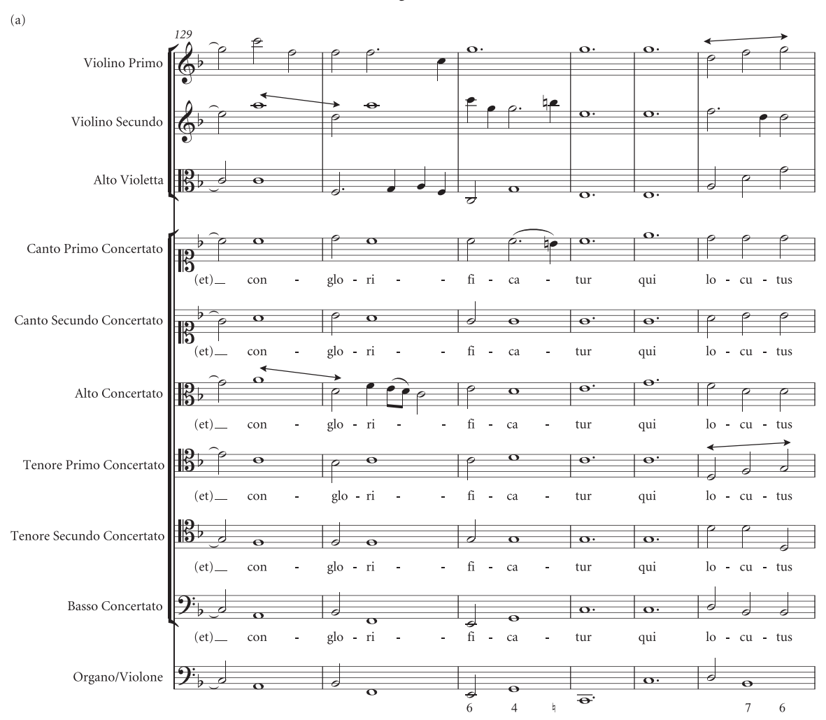
Ex.2 Antonio Bertali (a) Missa Minima, 'et conglorificatur'; (b) Missa Archiducalis, 'et invisibilium'

Because in most cases the sources of Bertali's Mass settings at Kroměříž are unica , it is difficult to determine whether such flaws are part of the original composition or the result of the