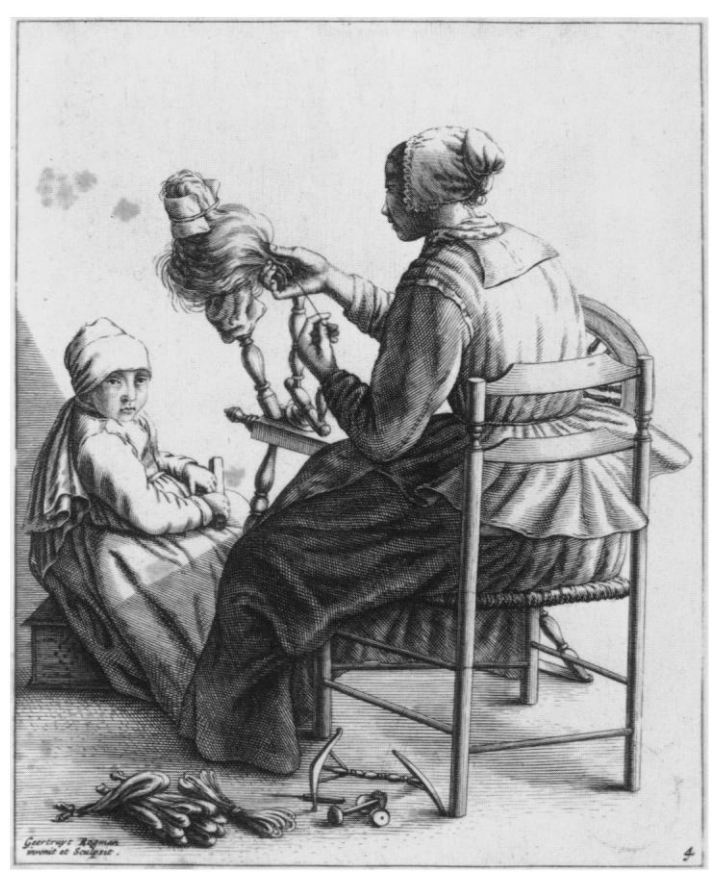
Fig. 4. Geertruydt Roghman, Woman Spinning and a Child, engraving, 21.3 cm. x 17.1 cm. Rijksprentenkabinet, Amsterdam.

hold text Houwelijck (Marriage). These illustrations also depict women in the midst of their households, governing all that transpires. As in Heemskerck's painting, many genre images include sewing implements to demonstrate the virtue of their female subjects and differentiate them from their servants, who do more physical menial work.<sup>16</sup>