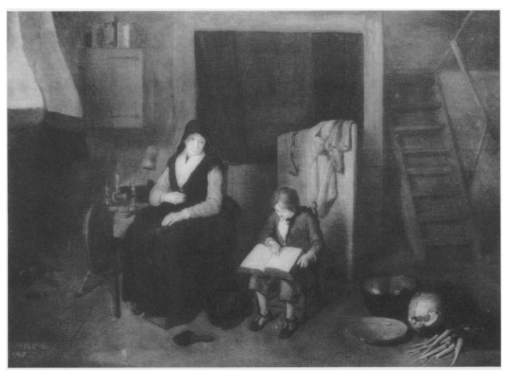
Fig. 9. Quiringh van Brekelenkam, Old Woman with Reading Boy (1665), oil on panel, 52.1 cm. x 72.5 cm. Location Unknown.

and spools rest on the floor to her left. It has been suggested that the scene emphasizes the communication and relationship between the mother and child, but the two do not really interact. The mother is absorbed in her work and the very serious, almost adult-looking child stares intently at the viewer. Neither impishly mischievous nor sweetly dutiful, like the children in most genre scenes, this is one of the least stereotypical depictions of a child in 17th-century Dutch art. Roghman's spinner and child avoid the sentimentality found in the work of many of her male contemporaries. She neither poses them in a contrived manner nor includes details to emphasize moralizing characteristics.