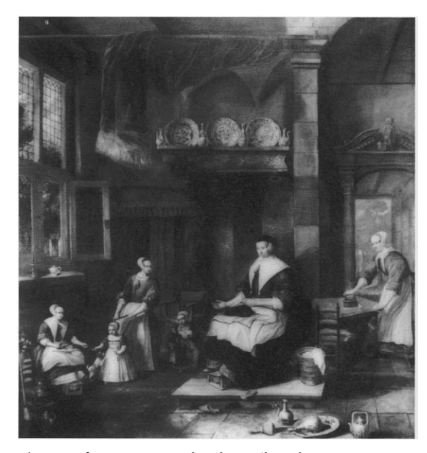
Fig. 6. Egbert van Heemskerck (attributed to), Mistress upervising Her Household, oil on canvas, 150 cm. x 141 cm. Location Unknown.

iar to women and a vice to which women often fall prey.