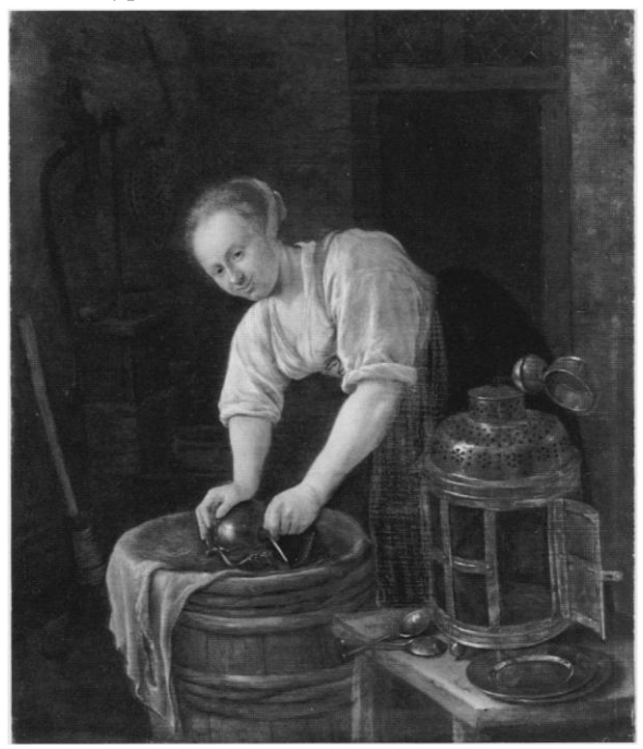
Fig. 11. Jan Steen, Woman Scouring Metalware (1654-58), oil on panel, 24.5 cm. x 20 cm. Rijksmuseum, Amsterdam.

intend her images to be either moralizing or erotic. Important to this conclusion is the fact that the prints were meant to be viewed as a series. They were numbered consecutively and published twice (the second publication was completed by I. Covens and C. Mortier). Moreover, they are related to one another in composition, setting, and detail. The only moralizing image of the series is the vanitas scene. It is, however, neither the first nor the last in the series, and thus does not dictate the meaning of the other images. Like the other scenes, it belongs to its own painting convention, which is separate and distinct from the other conventions. Furthermore, it is not an image of virtue and certainly does not determine that the other scenes should be read as such. This suggestion becomes untenable when the other scenes are placed in their conventional contexts. Could the scouring maid suddenly be seen as virtuous to an