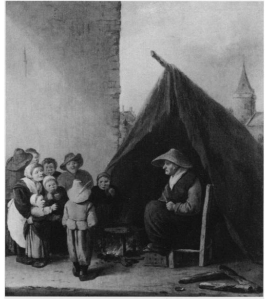
Fig. 8. Pieter de Bloot, Pancake Baker, oil on panel, 35.5 cm. x 31 cm. Location unknown.

In contrast, Roghman's spinner does not evoke these obviously moralizing intentions. Again, the back view of this woman actually engaged in spinning almost obscures her task. We glimpse only a portion of the wheel and staff with its wool. The skeins, winder, pick,