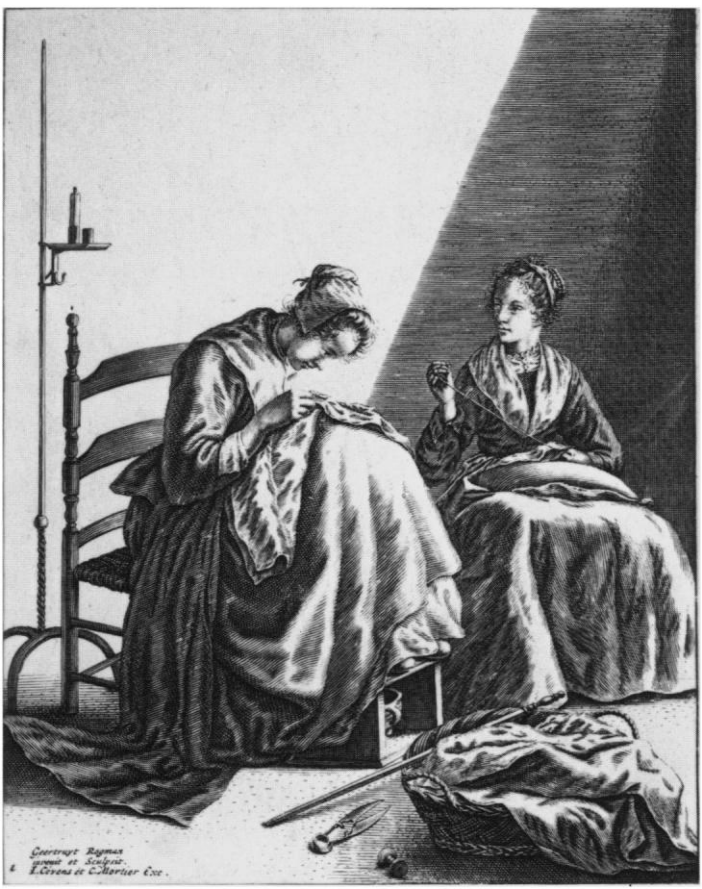
Fig. 1. Geertruydt Roghman, Two Women Sewing , engraving, 21.3 cm. x 17.1 cm. Rijksprentenkabinet, Amsterdam.

Perhaps the next works of Geertruvdt's short career are a series of 14 landscape prints done after drawings by her brother.6 Recent scholarship dates this series, Plaisante lantschappen ofte vermakelijcke gesichten na t' leven, to between 1645 and 1648, when both Geertruydt and Roelant were about 20 years old.7 The title plate, generally attributed to Claes Jansz. Visscher, informs us that the images were drawn by Roelant and printed by Visscher, but no etcher is indicated.<sup>5</sup> Fortunately, the initials G. R. are inscribed on four of prints, indicating Geertruydt's participation in the series. Attribution of the prints to Geertruydt is complicated, however, by the presence of the initials R. R. on five others.