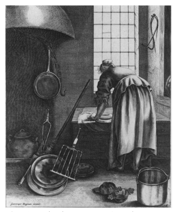
Fig. 5. Geertruydt Roghman, Woman Scouring Metalware, engraving, 21.3 cm. x 17.1 cm. Rijksprentenkabinet, Amsterdam.

Roghman's image differs radically from this type of vanitas image; in fact, it is difficult to ascertain precisely the activity of