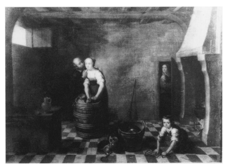
Fig. 10. Jan van Hoeven, The Kitchenmaid (1655), oil on canvas, 51.4 cm. x 71.7 cm. Location Unknown.

were those that acted out the sexual innuendo in a playlike fashion, as in The Kitchenmaid (1655; Fig. 10) by Jan van Hoeven. The young woman scrubs a metal plate and is surrounded by vessels with rounded openings that face the viewer. Open-mouthed vessels were commonly used as metaphors for the female sexual organs.27 The young girl, apparently a maid, looks up at her lecherous old master who embraces her and directs her face toward his. An older woman, probably his wife, angrily observes them through the doorway. Even without such dramatics, images depicting this theme usually are filled with sexual symbols, for example, Jan Steen's Woman Scouring Metalware (c. 1654-58; Fig. 11), where a voluptuous young maid laughingly greets the viewer's gaze. Behind her is the frequently included and sexually symbolic spout that is directed toward the open-mouthed pot below-obviously indicating the type of bawdy