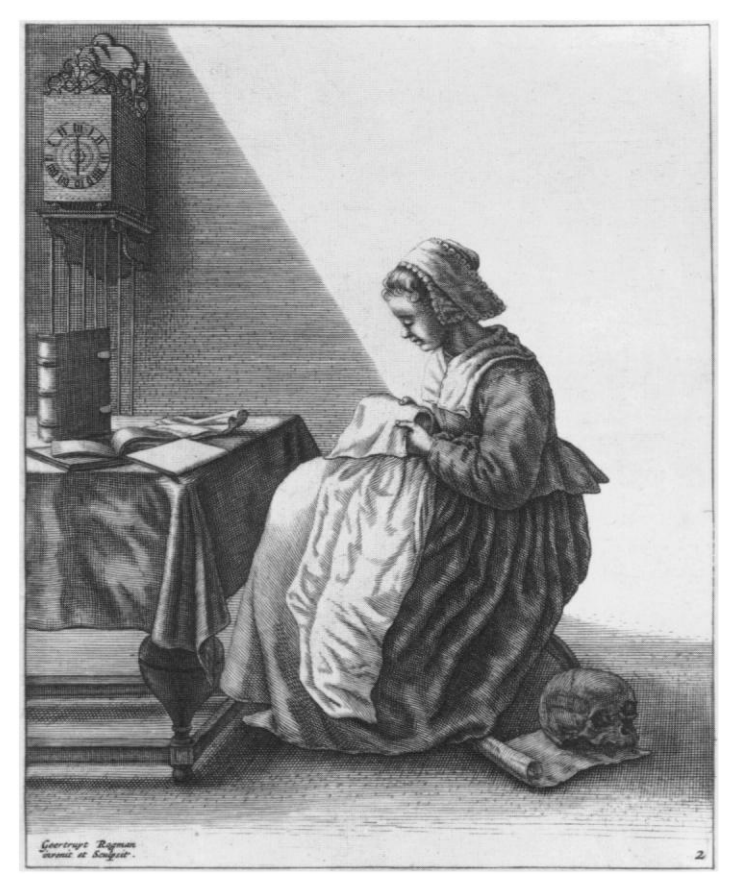
Fig. 2. Geertruydt Roghman, Woman with Vanitas Objects, engraving, 21.3 cm. x 17.1 cm. Rijksprentenkabinet, Amsterdam.

Ordinarily, one would assume that the initials identify the etcher—either Geertruydt or Roelant—of these nine prints, but this assumption is probably incorrect. It has been pointed out that all the etchings display a similarly engravinglike effect that is quite different from the free, sketchy quality of Roelant's known prints.<sup>9</sup> The careful technique and engraved quality of these prints are much closer to Geertruydt's style. Of further importance is the fact that one set of initials was changed from G. R. to R. R. in a later state, suggesting that perhaps all the initials were added afterward by someone trying to attribute the prints. In summation, most scholars seem comfortable attributing all the etchings but the title plate to Geertruydt Roghman.<sup>10</sup>