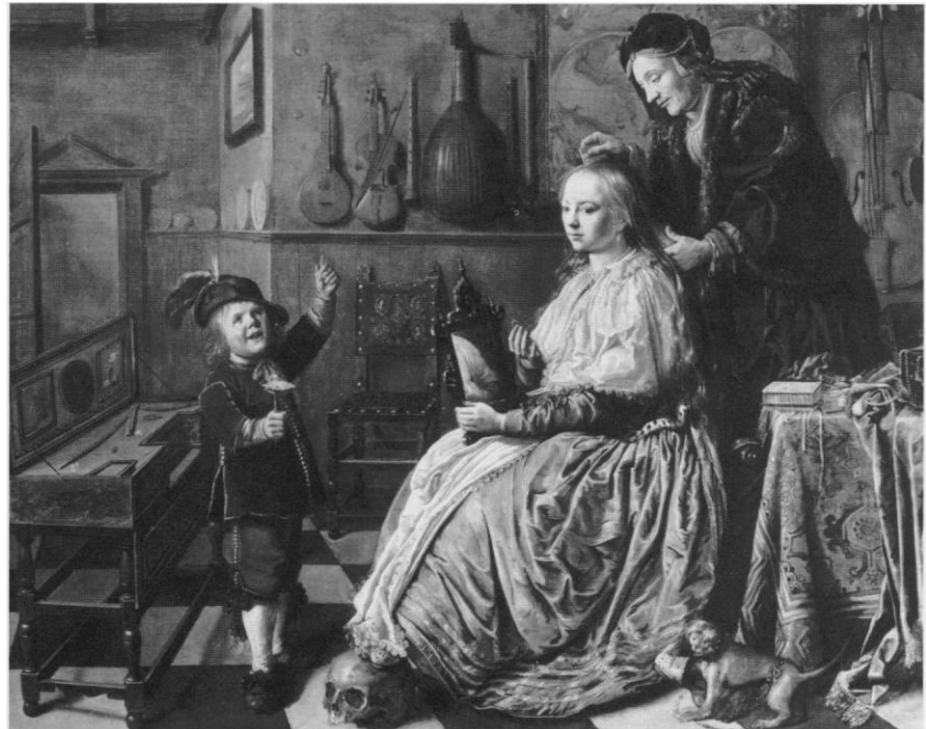
Fig. 7. Jan Miense Molenaer, Lady World (1633), oil on canvas, 102 cm. x 127 cm. Toledo Museum of Art.

In contrast, Roghman's scene contains none of these moralizing indications. We cannot even discern the woman's age. Again, anecdote and metaphor have been eliminated to concentrate on the woman at her task. Since this obscured view does not demonstrate how to make pancakes, the print would not have been designed to illustrate a household man-