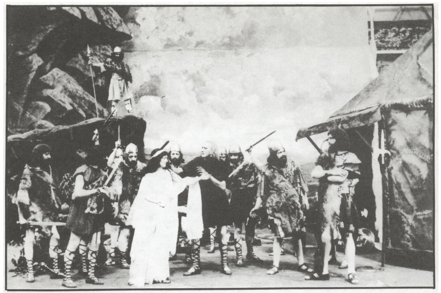
Ingomar, Porter/Edison Sept 1908

filmic elements to a preoccupation with the pro-filmic, from a conception of cinema as a special kind of magic lantern to cinema as a special kind of theatre.