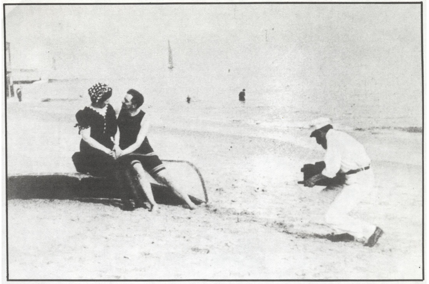
Getting Evidence, Porter/Edison Sept 1906