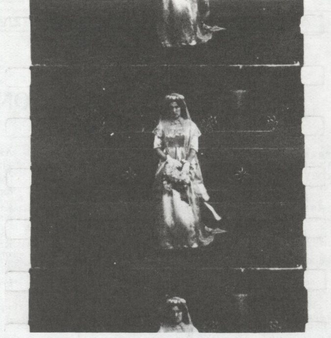
Waiting at the Church: Vesta Victoria singing the title song, Porter/Edison Jan 1907

* We have changed the title of this section to avoid the invidious distinction between film theory and practice