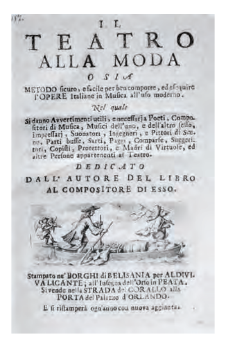
The Title Page of Benedetto Marcello's Treatise Il Teatro alla Moda (Venice, c.1720). Wienbibliothek im Rathaus, Vienna. Sign. A 44971.

and they have no need for light either, because they know their parts by heart. The ideological justification for the practices here described is to be found in the high measure of stylisation in Baroque acting, in which characters' emotions and even individual words were visualised by a set system of postures and gestures. For such an acting style, based predominantly on the declamation of lines, scenography represented a certain desirable decorative framework; in essence, however, it was not indispensable. Due to the perspective painting of the decorations, it was possible to act only in the front of the podium, and the more distant parts of the stage could not be used for acting, but simply as a background for tableaux vivants . With a view to this practice it becomes more acceptable that a collection of about ten archetypal decorative sets was perceived as fully sufficient for any production requirements of the operatic repertoire.