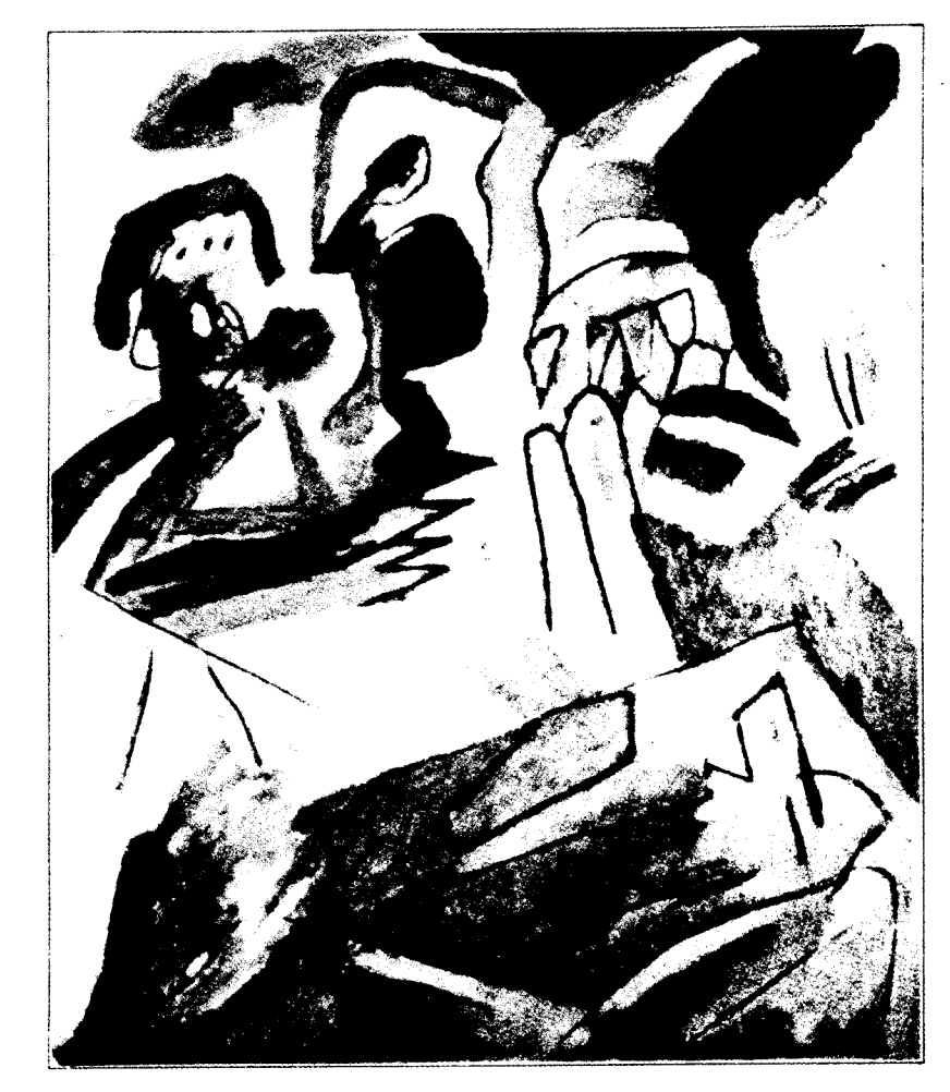
Kandinsky, Improvisation No. 18