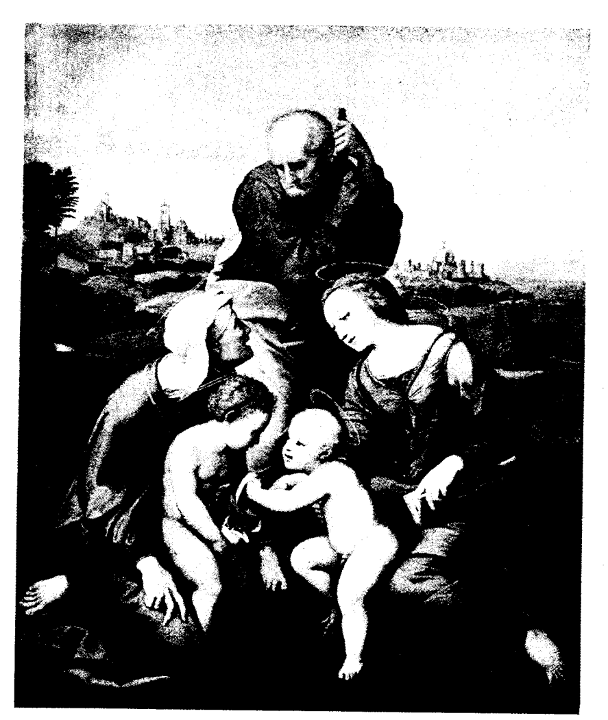
Raphael, Holy Family.

Form in the narrower sense is nothing more than the delimitation of one surface from another. This is its external description. Since, however, everything external necessarily conceals within itself the internal (which appears more or less strongly upon the surface), every form has inner content.* Form is, therefore, the expression of inner content. This is its internal description. Here, we must think of the example used a few moments ago—that of the piano, and for "color" substitute "form": the artist is the hand that purposefully sets the human soul vibrating by pressing this or that key (= form). Thus it is clear that the harmony of forms can only be based upon the purposeful touching of the human soul.