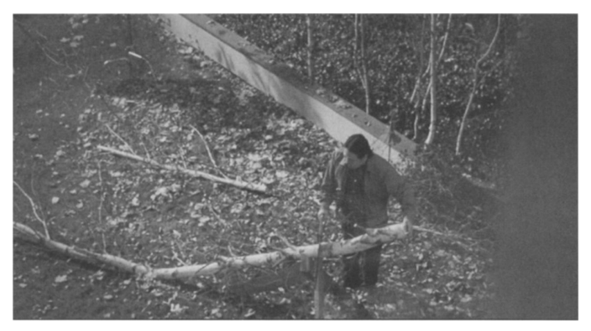
Figure 7. Neither black nor white: Cathy's new, ethnically ambiguous gardener in Todd Haynes's Far from Heaven (Focus Features, 2002).

moral lessons. Rather, Far from Heaven's untimeliness owes to the fact that its moral lessons—its clichéd brand of antiracism, its injunctions to tolerance and inclusion of "others"—belong to the past as well. That was a time when the United States was, in the words of George Fredrickson, an "overtly racist regime," when the battles for rights and recognition from the state was a live one, when discrimination by individuals looked like both cause and effect of social inequality and injustice, when legal segregation was the paradigmatic form of intolerance. The public consensus on these issues has undeniably shifted, although we may still feel dissatisfied with the current state of things.