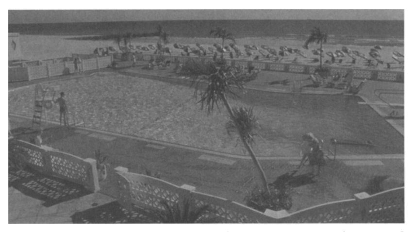
Figure 6. "Over-determination from without": An empty pool evacuated after a black child has touched the water in Todd Haynes's Far from Heaven (Focus Features, 2002).

constructed world."88 And, "As the terms of the world shift so must the recognition of its changing audiences be continually resolicited."89