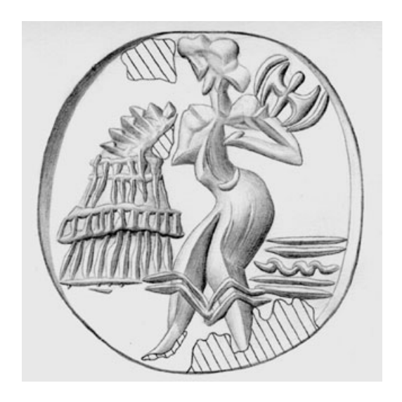
Figure 7 CMS II.3 8.

a sense 'labelled' by the Double-Axe but they appear to show an action or a process: the carrying of the Double-Axe, together with some type of garment or cloth (in the case of three of the depictions), from one place to another (compare to the description of narrative given by Cain 2001, 29–30). For this reason most scholars have not identified these figures as deities or regarded the Double-Axe as a particular attribute of these figures but have interpreted them as doing exactly what they appear to be doing: carrying the objects to something or someone 'off-scene'. Usually this something or someone is said to be the goddess who is thus 'borrowed' from the post-Neopalatial depictions.