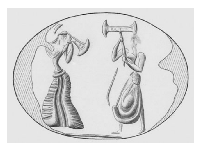
Figure 4 CMS II.6 10.

The difference between these and the post-Neopalatial depictions is clear. Unlike the LM III depictions, the point of these does not seem to be just to show a figure marked by and in