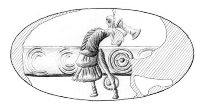
Figure 6 CMS V suppl. 3 394.