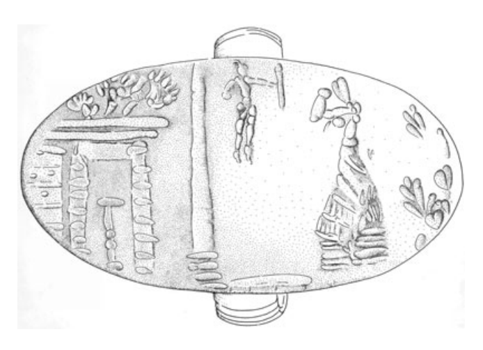
Figure 3 Ashmolean gold ring (drawing by J. Kelder).

always bare (see the depictions just cited and Alexiou 1963; Graham 1970). This example hints that symbolic change did occur through the Late Bronze Age on Crete with symbols from earlier periods being combined and associated in novel ways.