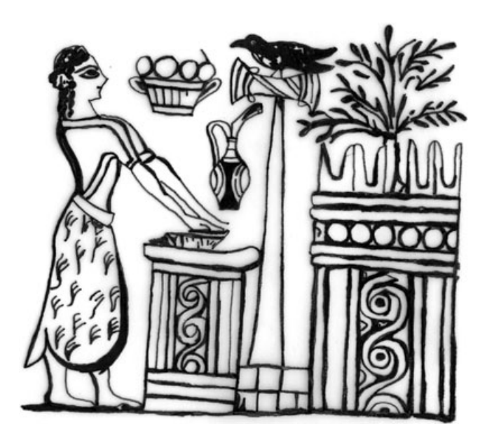
Figure 2 Detail from the Agia Triada sarcophagus (author's drawing).

the Agia Triada sarcophagus, which is now securely dated to at least as late as LM IIIA2 thanks to Militello and La Rosa (2000, 996–7). Finally, the Double-Axe appears in a famous and complex scene on a solid gold ring from the Acropolis Treasure at Mycenae ( CMS I 17). This ring is very difficult to date. However, it has been well established that it was a mainland product and that it combines symbols in a way that is totally alien to Cretan practice – even if many of those symbols were originally Cretan (Niemeier 1990, 167; Krzyszkowska 2005, 254–5).