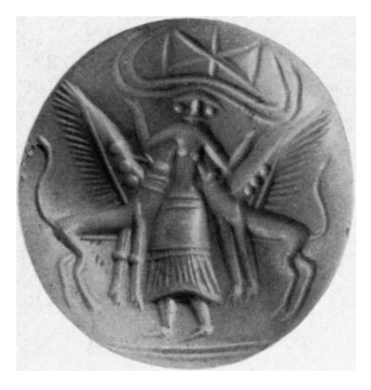
Figure 1 Silicone impression of LM II-III seal from Knossos (CMS II.3 63).

highlight those patterns in the wider material evidence that may have a direct impact on the understanding of the Double-Axe as a symbol.