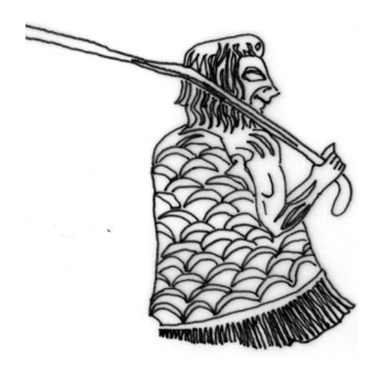
Figure 8 The leader of the procession from the Harvester Vase (author's drawing).

from Agia Triada (Fig. 8) and if true this must surely extend to the seal from Knossos and the sealing from Thera as well. This garment is marked by being quite short, having a fringe, and appearing to have scales.<sup>7</sup> In all three depictions there seems to have been an attempt to depict each of these features.<sup>8</sup>