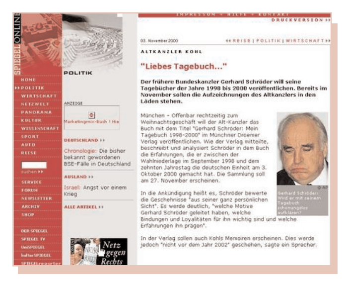
Image 1. Insert_coin (2000) by Dragan Espenschied and Alvar Freude

the time to make the minor adjustment in order to regain access to unfiltered information. Several months after the end of the experiment web access from most of the Academy's computers was still being filtered.